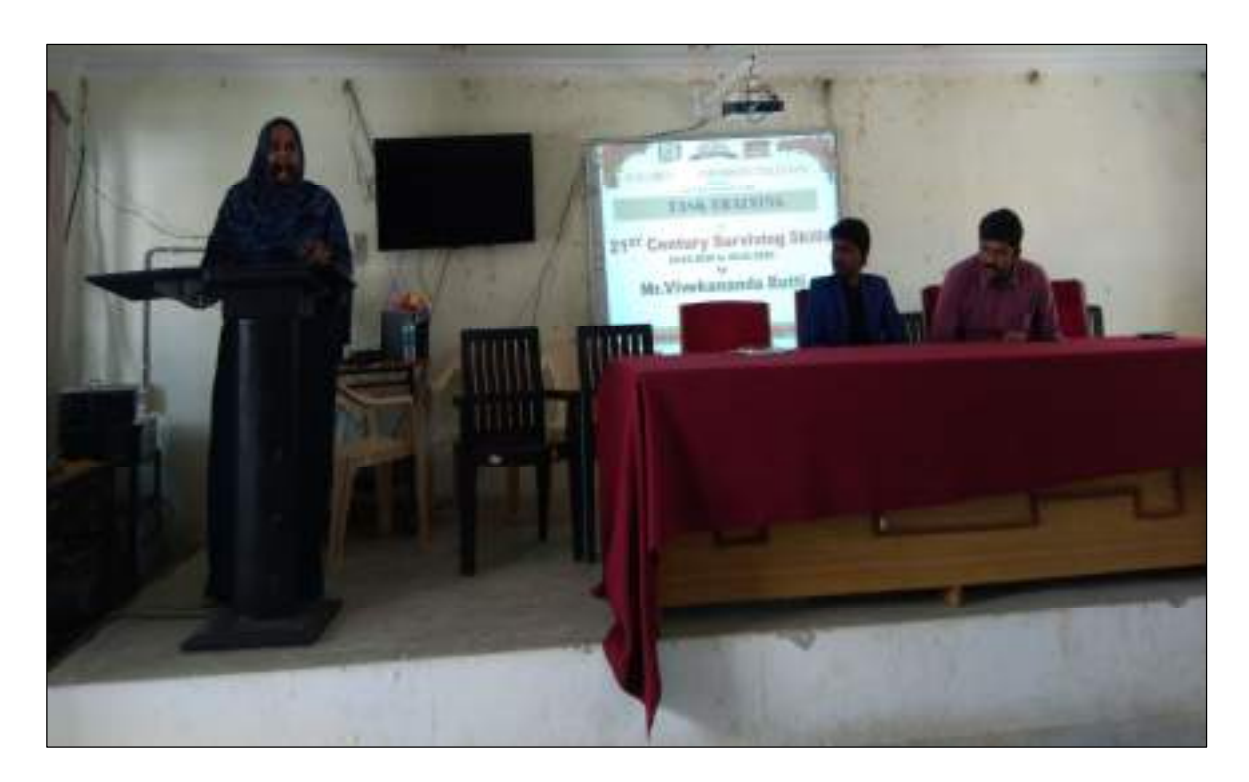
Principal Addressing in Inaugural Session