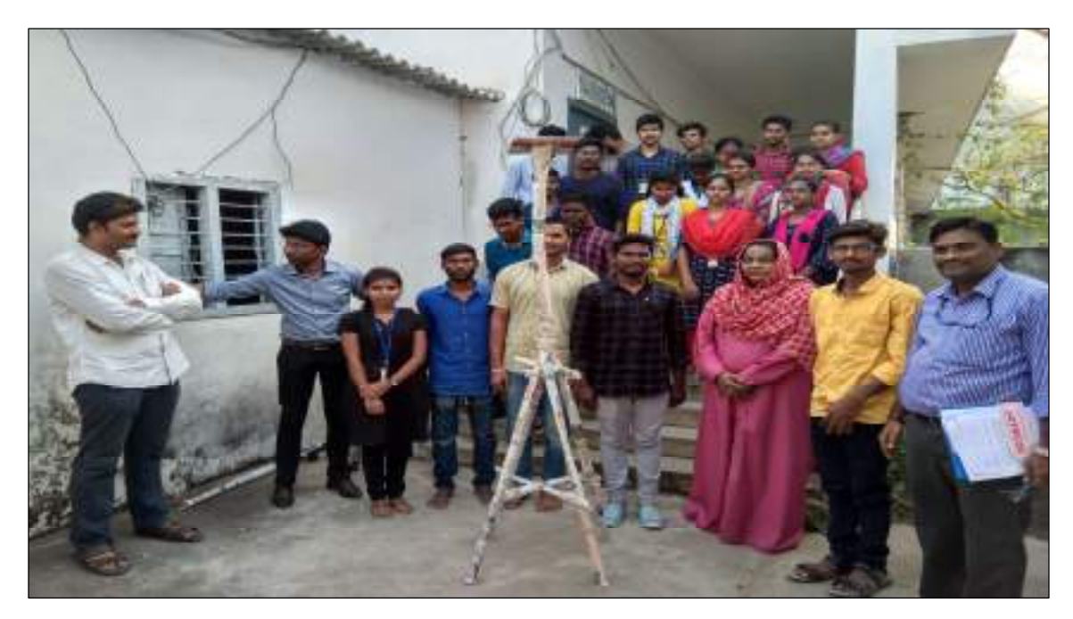
Students Prepared Tower by using news papers