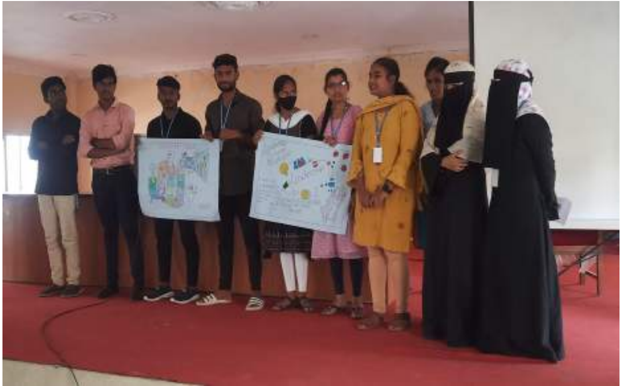
Poster Presentation Activity