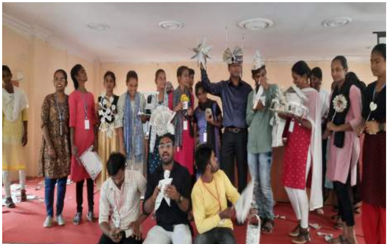
Paper Craft Presentation Activity