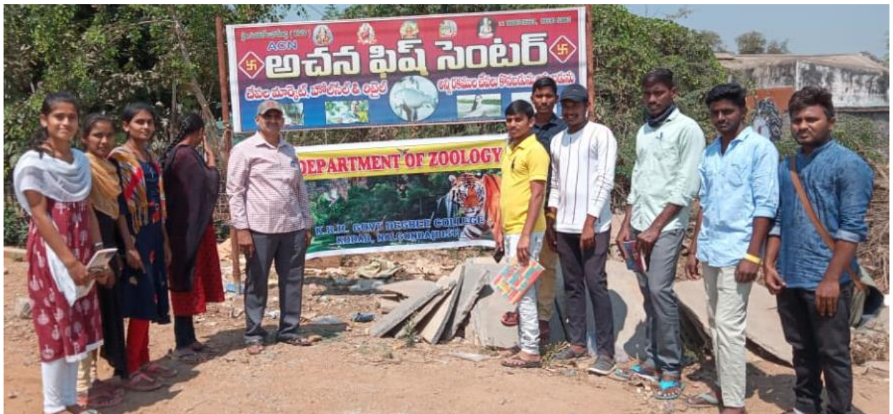
IDENTIFICATION OF FISH FAUNA :: A FIELD VISIT AT ACHANA FISH CENTER