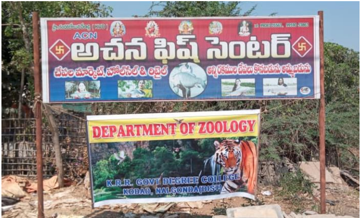
IDENTIFICATION OF FISH FAUNA :: A FIELD VISIT :: FISH MARKET KODAD TOWN