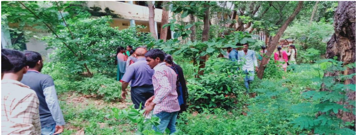
FIELD TRIP BY BSC BZC II YEAR STUDENTS IN THE K.R.R CAMPUS