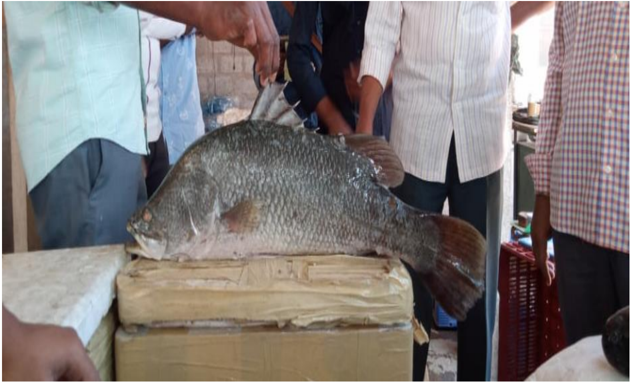
IDENTIFICATION OF FISH FAUNA :: RARE FISH IN THE MARKET (PANDUGAPPA)