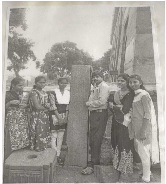
Broide Quisa Mahal Explaining Inscription