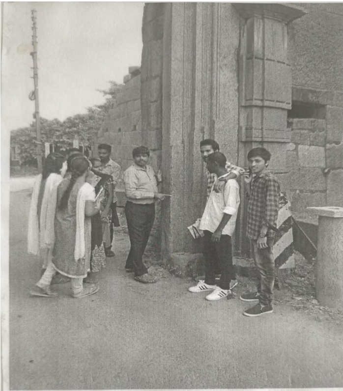
East fort first entrance