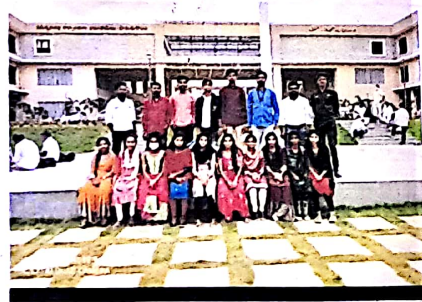
COLLECTORATE - WGL

[Signature] 11/03/21 L. Madhulax Department of English