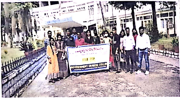
ADMINISTRATIVE BLOCK K.V. WARANGAL