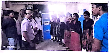
VISITEN NEAR BY USBI BANK SIRPUR KAGAZNAGAR - KUMURAMBHEEM ASIF

BANK MANAGER IS EXPLAINING ABOUT — ATIO N