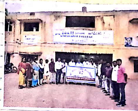
While starting from the College G.D.C KZR.