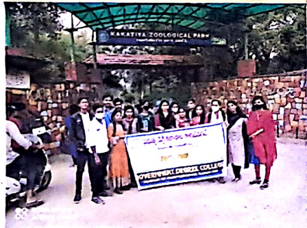
ZOOLOGICAL PARK - WGL