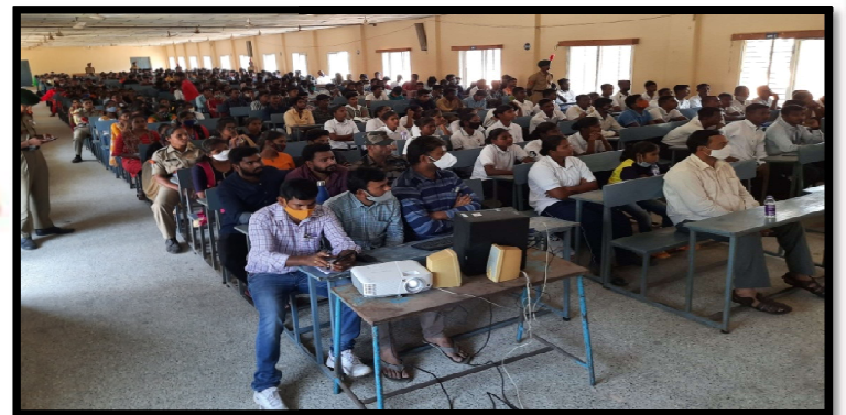
List of Participants