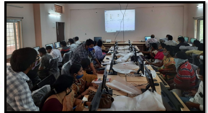
Teaching staff Practice