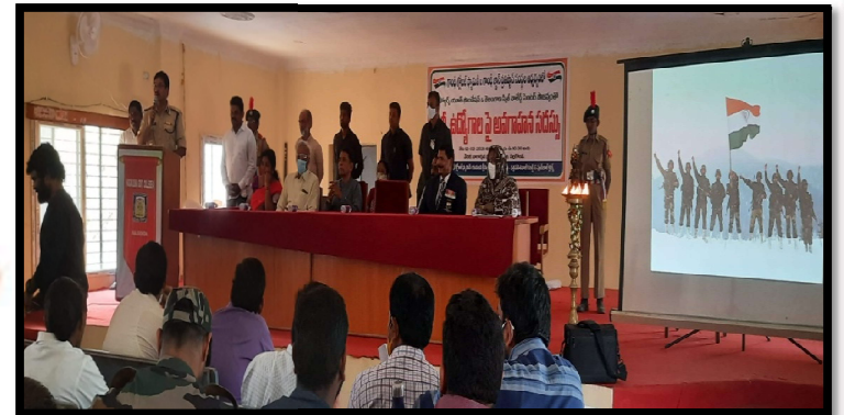
Superintend of Police motivating the youth to join in Indian army