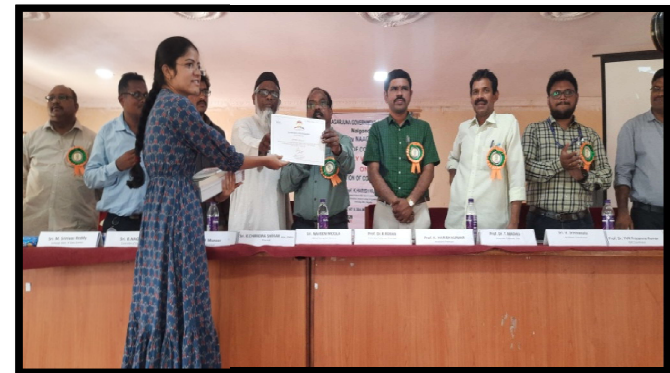
Student Receiving Certificate along with Books