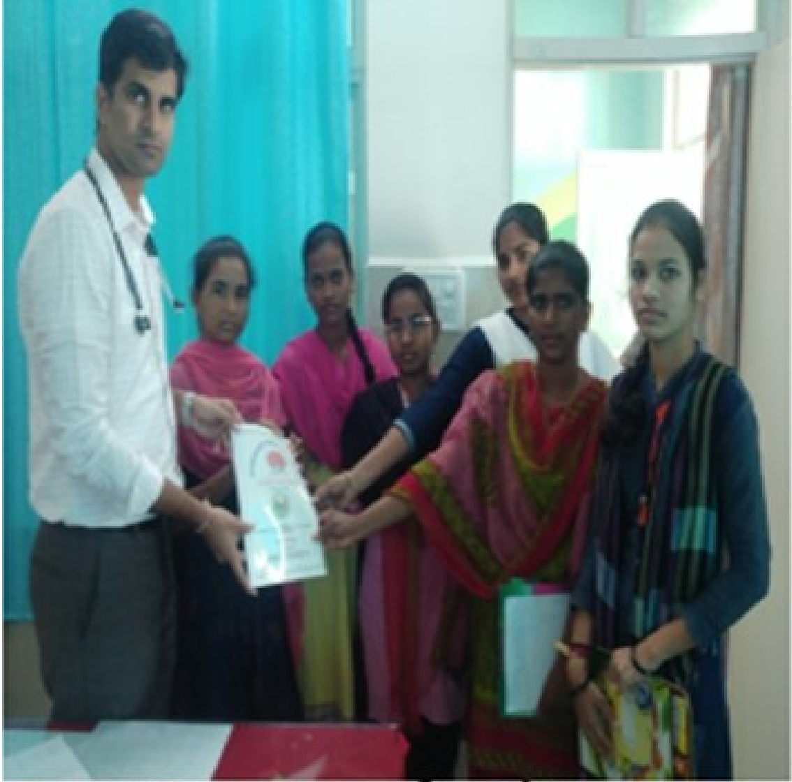
ఆసుపత్రి సూపరింటెండెంట్ కు నివేదిక సమర్పిస్తున్న స్టడీ ప్రాజెక్ట్ సభ్యులు