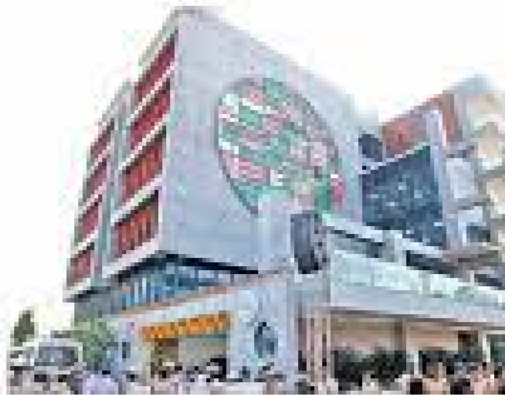
The IT Hub which was inaugurated last year in Khammam

The new facility would come up next to the existing IT Hub which has a seating capacity of 450 seats at Tel-