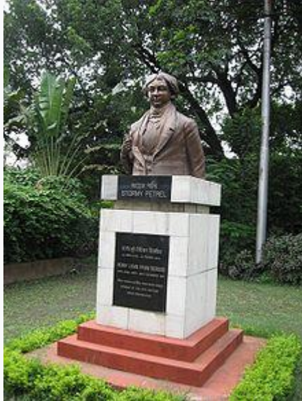
Bust of Derozio at the Esplanade