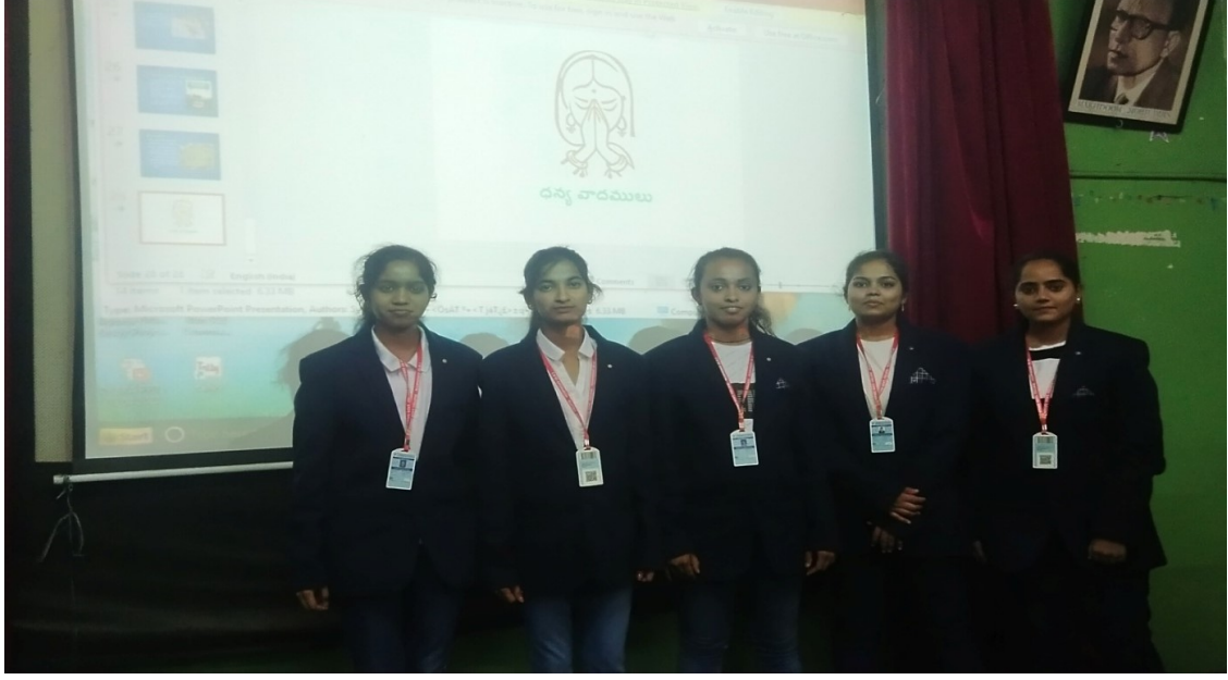
రాష్ట్ర స్థాయిలో ప్రదర్శన