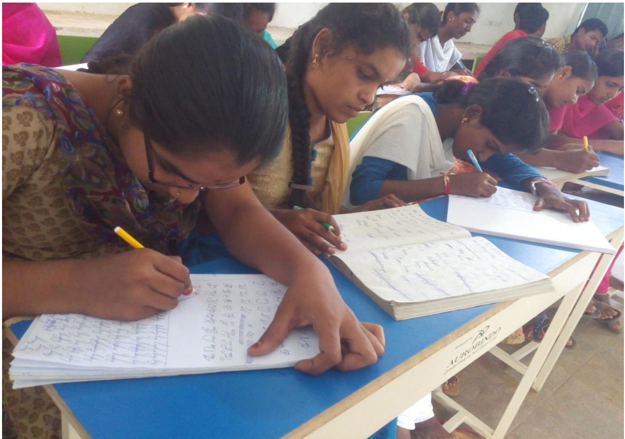
Students practicing beautiful hand writing