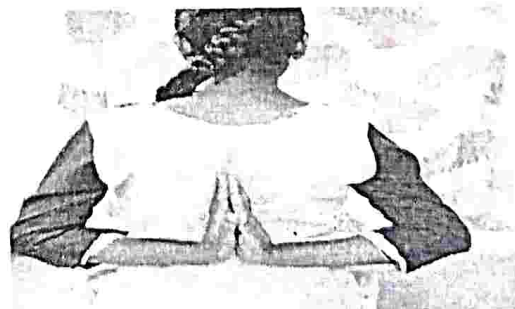
Name: Ch Poojitha government degree college siddipet women's TS19SWA550417 Unit: 9(1) BT NCC