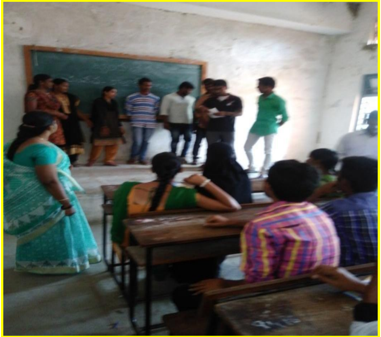
Students presentation on communication skills