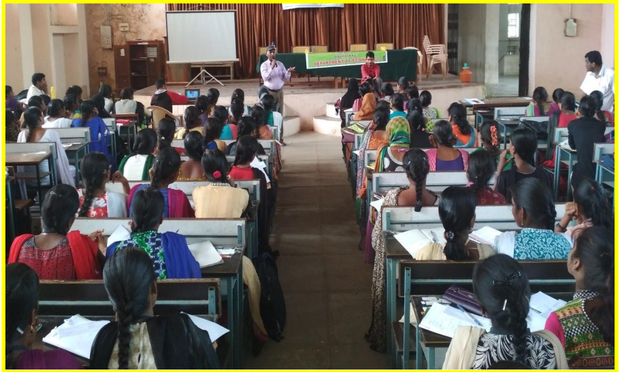
Training for students under the mou