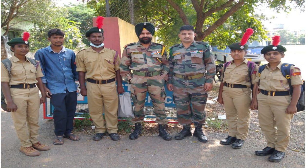
OUR CADETS WENT TO TSC CAMP SELECTIONS AT KARIMNAGAR