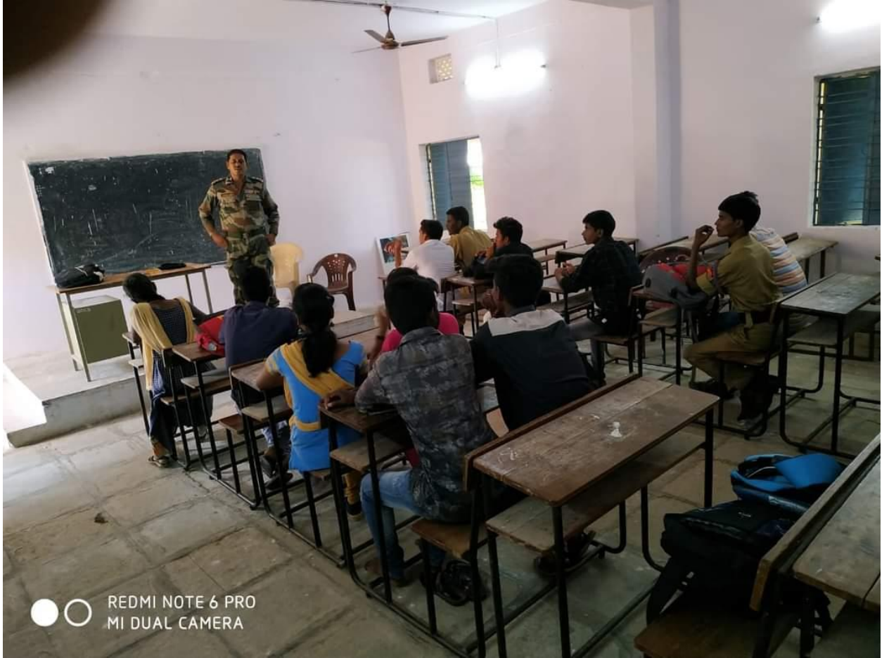
INSTITUTIONAL PARADE CLASS BY PI STAFF FROM 33TBN SANGAREDDY .