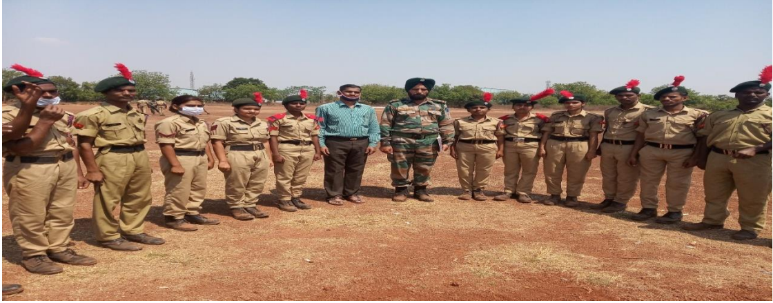
Cadet camp at Ranjole