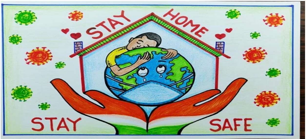
SGT.M.BHUVANESHWAR GOT SILVER MEDAL IN ONLINE DRAWING COMPITITION AT BN LEVEL