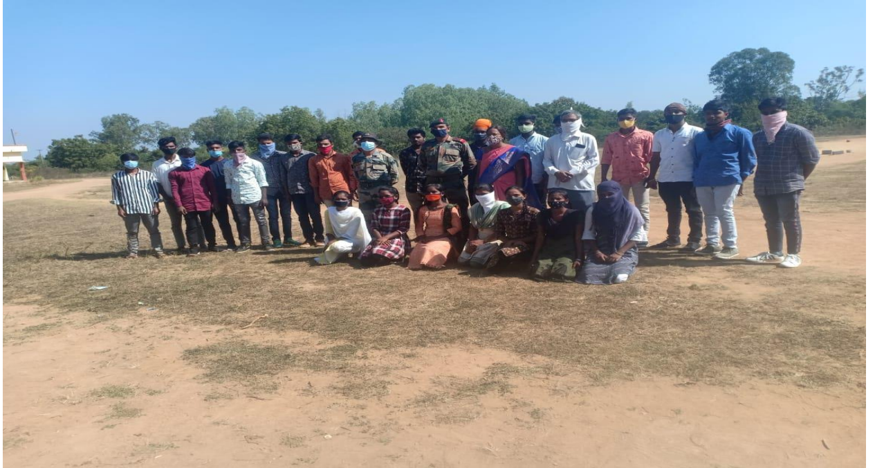
2020 ENROLLMENT FIRST PHASE STUDENTS