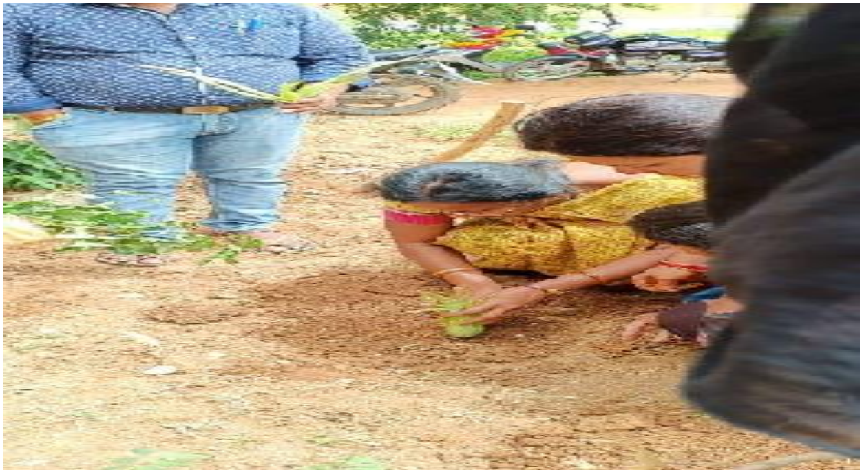
HARITHA HARAM PROGRAMME