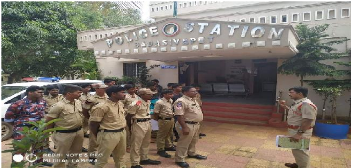
DETAILED CADETS FOR GANESH BANDOBAST,PULSE POLIO,ETC..TRAINING WITH CI SIR OF PS SADASIVPET