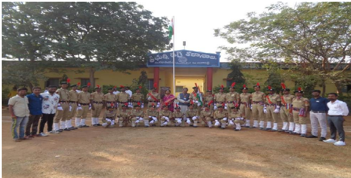
INSTITUTIONAL NATIONAL FESTIVALS CELEBRATIONS WITH OUR CADETS