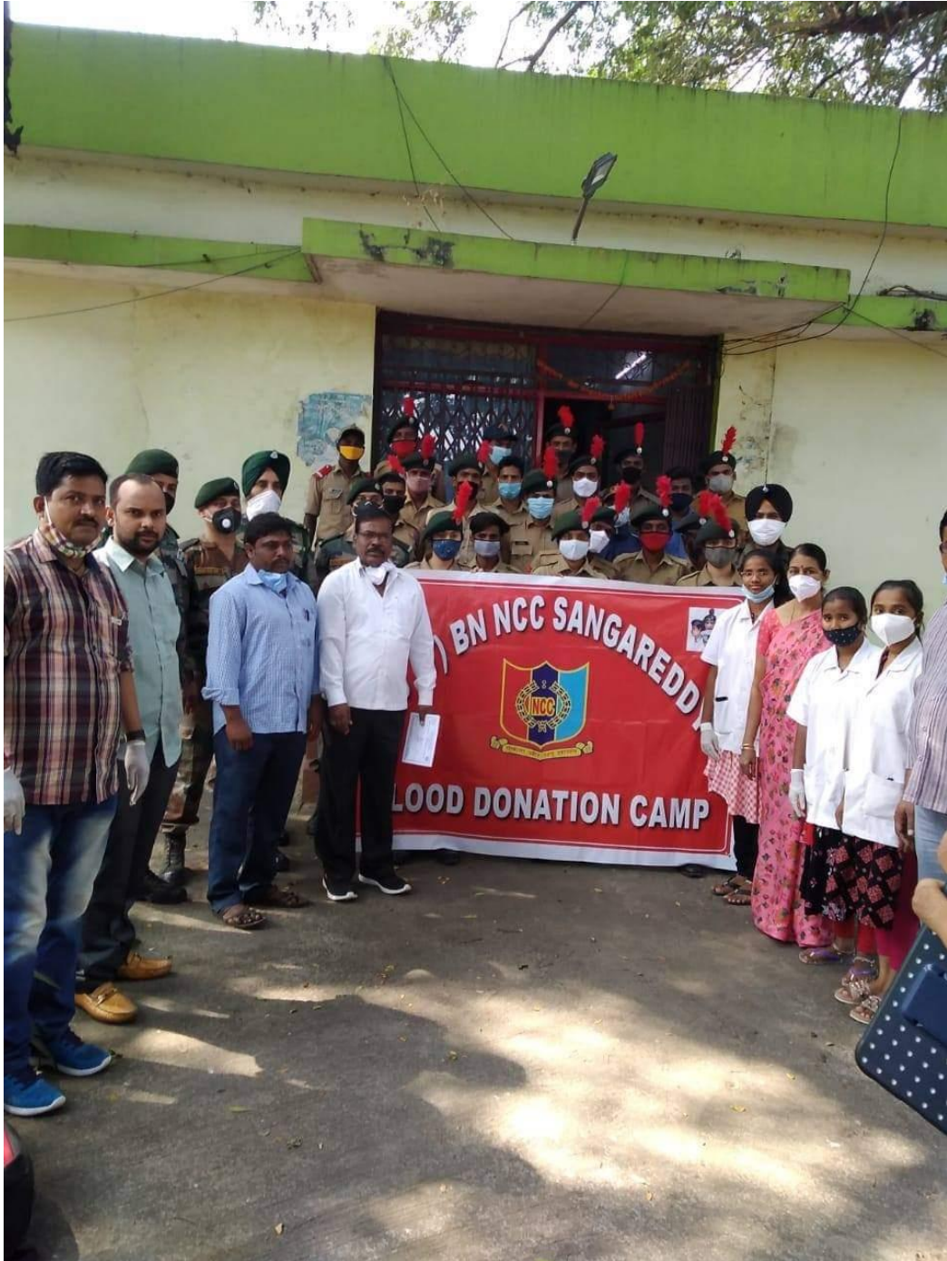
OUR CADETS PARTICIPATED AND DONATED BLOOD DONATION CAMP AT GOVT HOSPITAL SANGAREDDY.