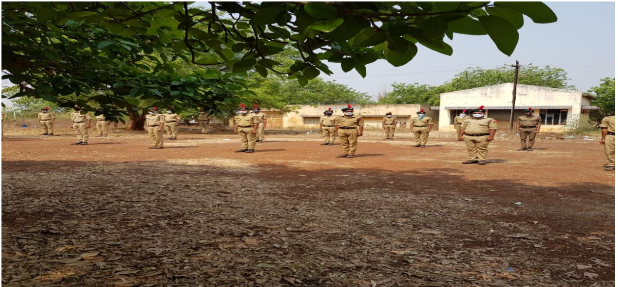
Cadets in NCC practical examination