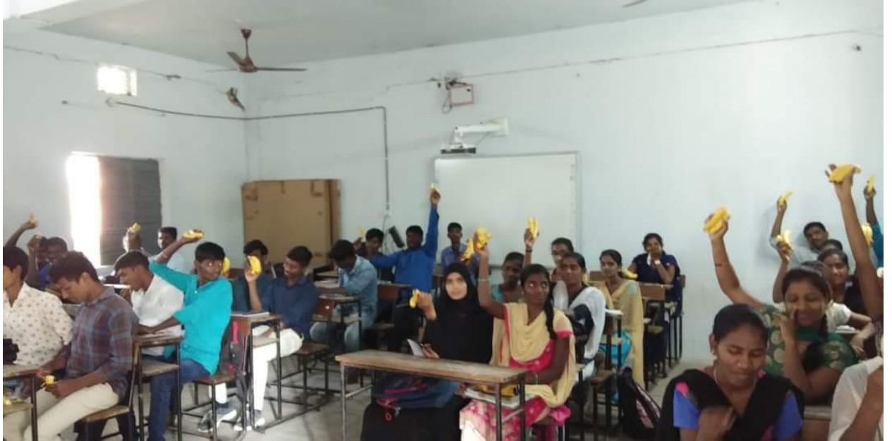
CADETS ENJOYING PARADE REFRESHMENTS