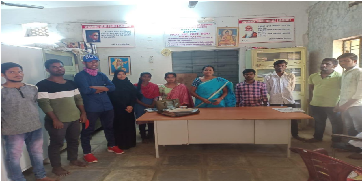
LOCAL RDC CAMP SELECTED CADETS