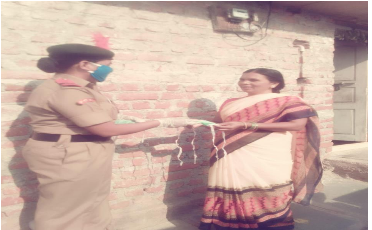
COVID PRECAUTIONS GIVEN TO THEIR NEAR COMMUNITY BY OUR CADET.