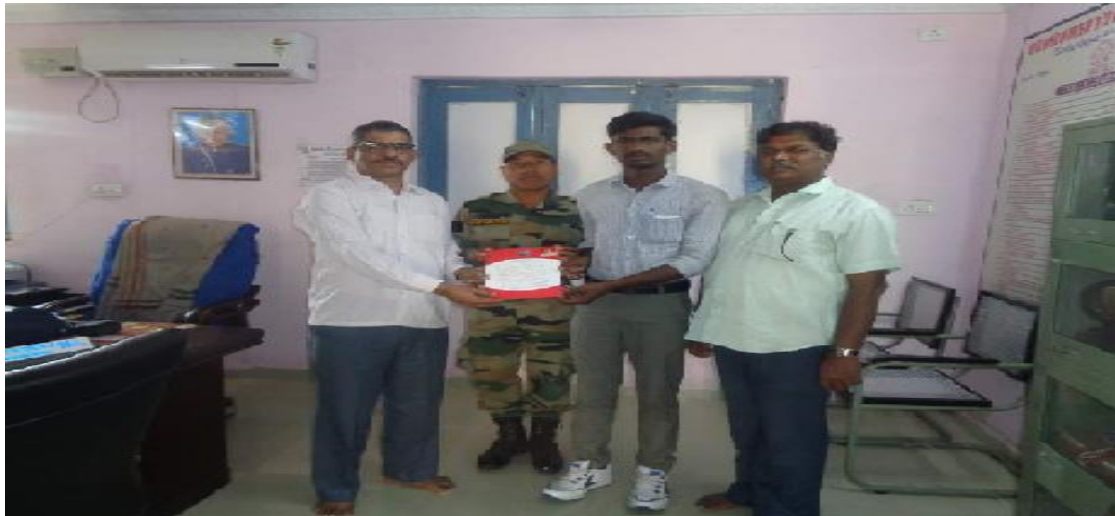
SELECTED NCC GROUP(NIZAMABAD) BEST CADET HONOUR IN THE YEAR OF 2019-20