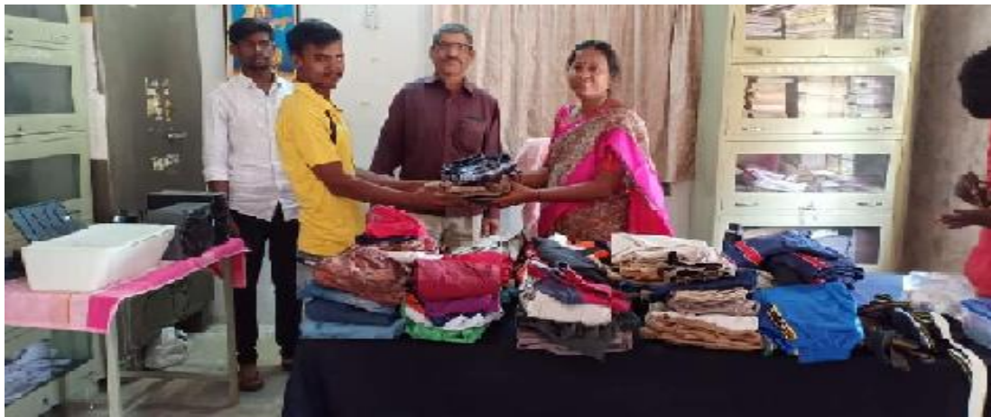
DONATED CLOTHES TO OUR POOR CADETS.