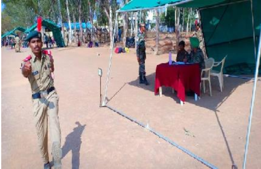
OUR ANO ACTED AS A SELECTION BOARD MEMBER OF PRACTICAL EXAM OF B, C EXAMS