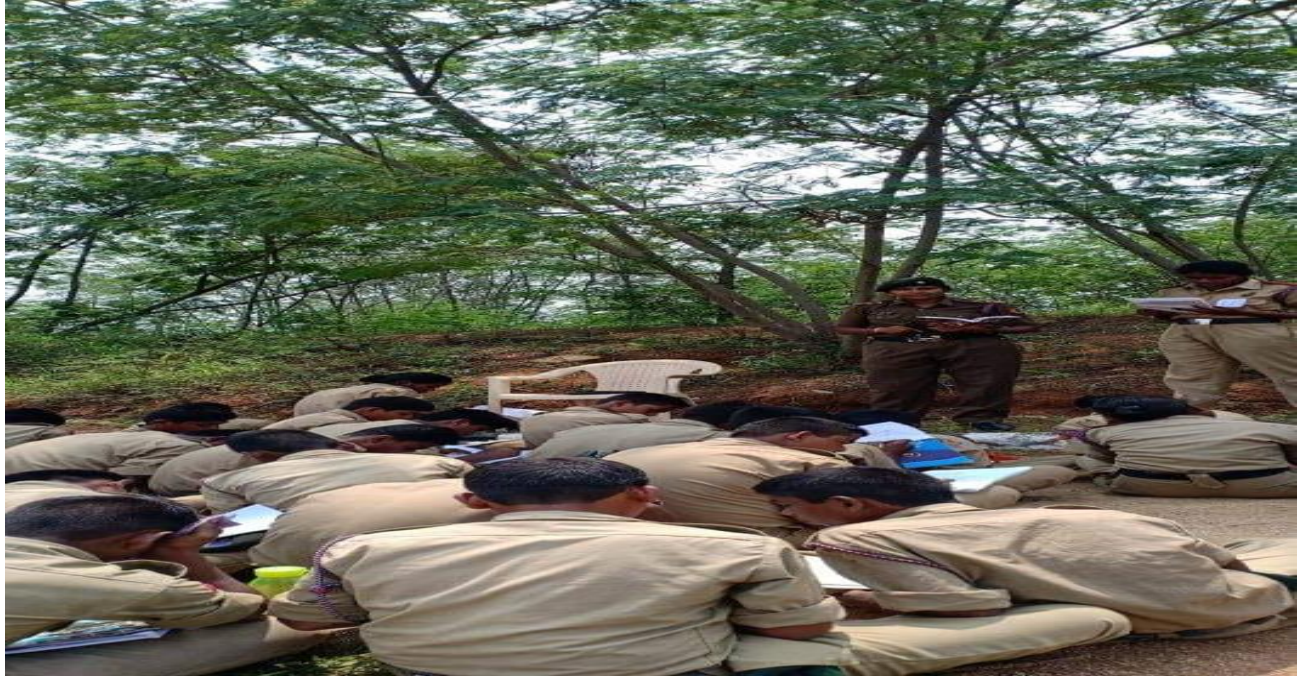
ANO CLASSES FOR CERTIFICATE EXAMS AT CATC CAMPS