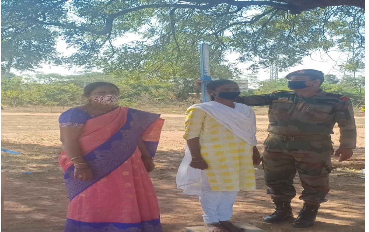
NCC ENROLLMENT BY THE STAFF OF 33TBN,SANGAREDDY.