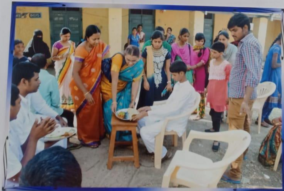
CADETS DONATED FOOD ,CLOTHES,BOOKS,MILK FOR THE CHILDREN OF SABITHA EDUCATIONAL FOR DISABLED CHILDREN,SANGAREDDY.