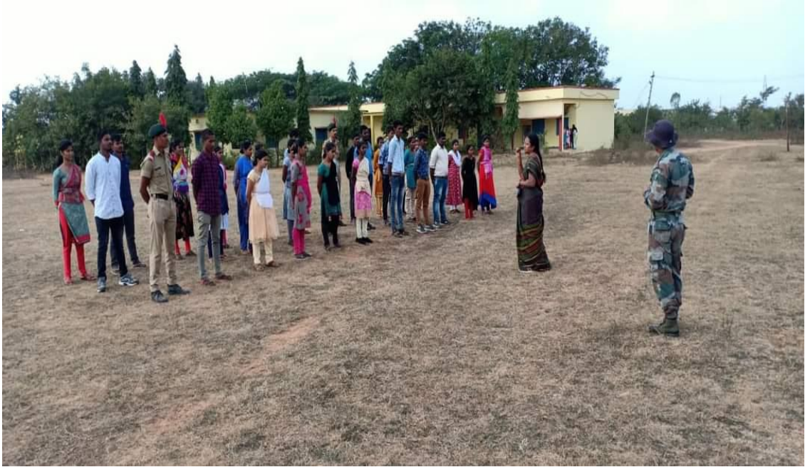
INSTITUTIONAL PARADE CLASS BY ANO