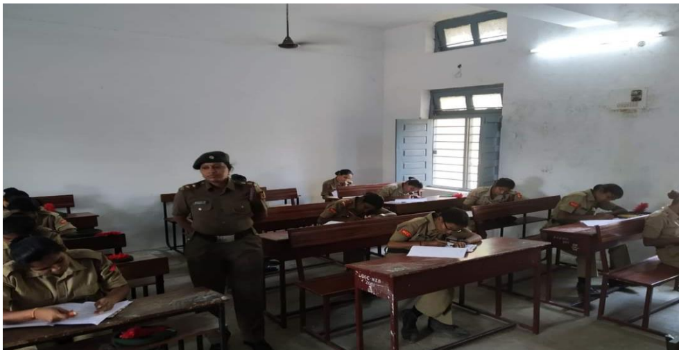
NCC CERTIFICATE EXAM INVIGILATION BY ANO AT NIZAMABAD GROUP .