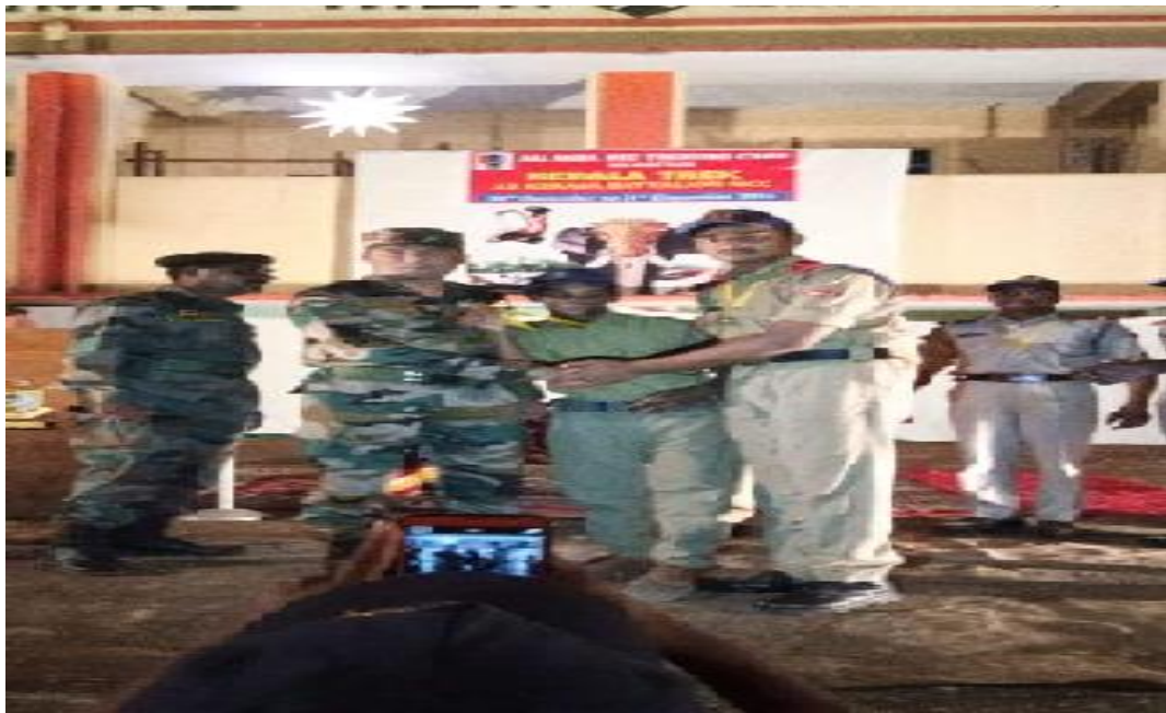
Cultural – Cadets Performing in camp