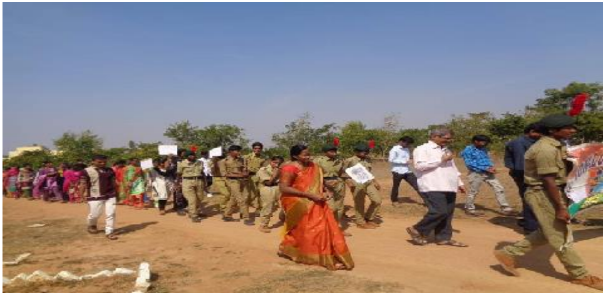
SWACHTHA PACHWADA RALLY TO SIDDAPUR VILLAGE