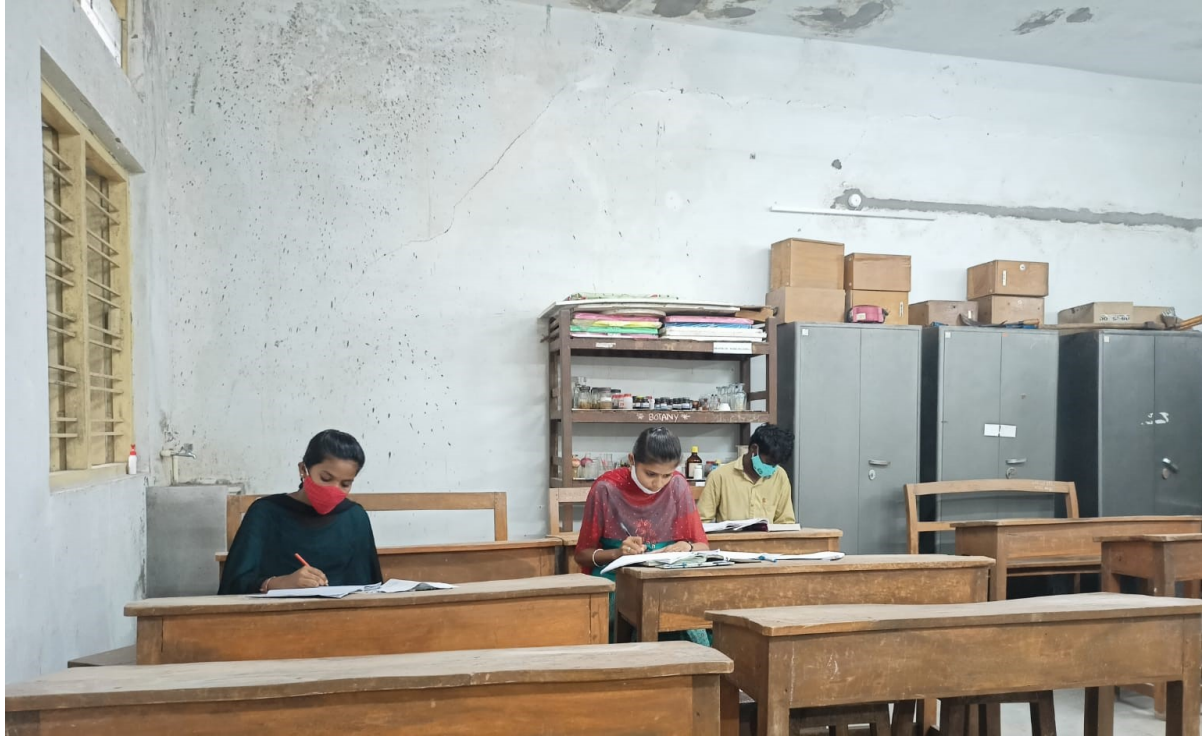
OLD QUESTIONS PAPERS – PRACTICE SESSION