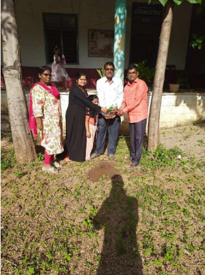
Balakishan sirs birthday