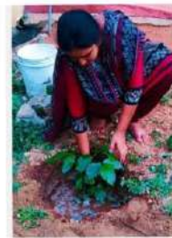
Nature is painted for us let us protect it