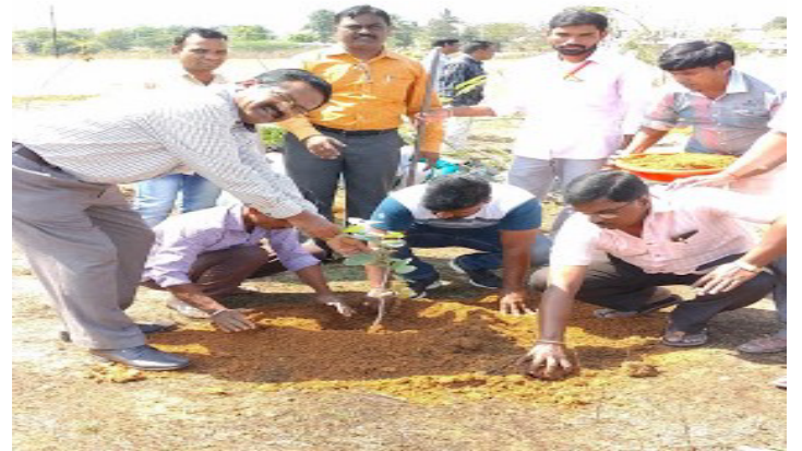
PARTICIPATED IN HARITHAHARAM ON 18/02/2021.