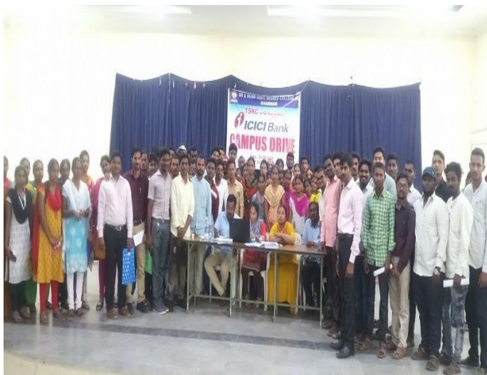
iv. Selected students.