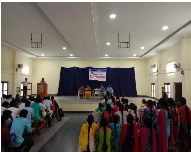
i. Principal speech about Drive