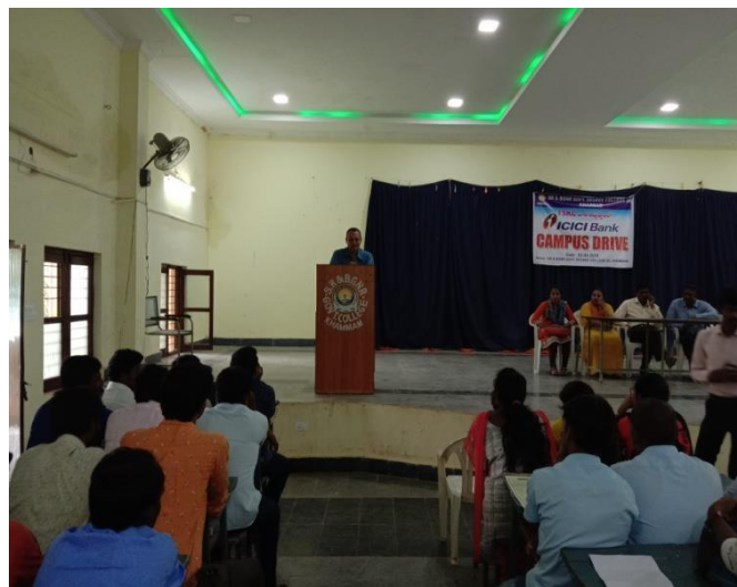
ii. Employment officer speech about Drive