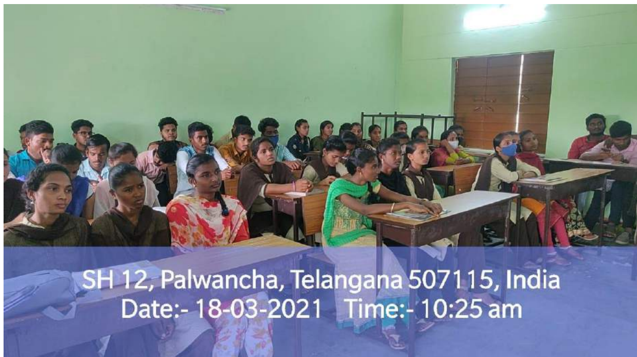
Students of GDC Paloncha participate in the webinar