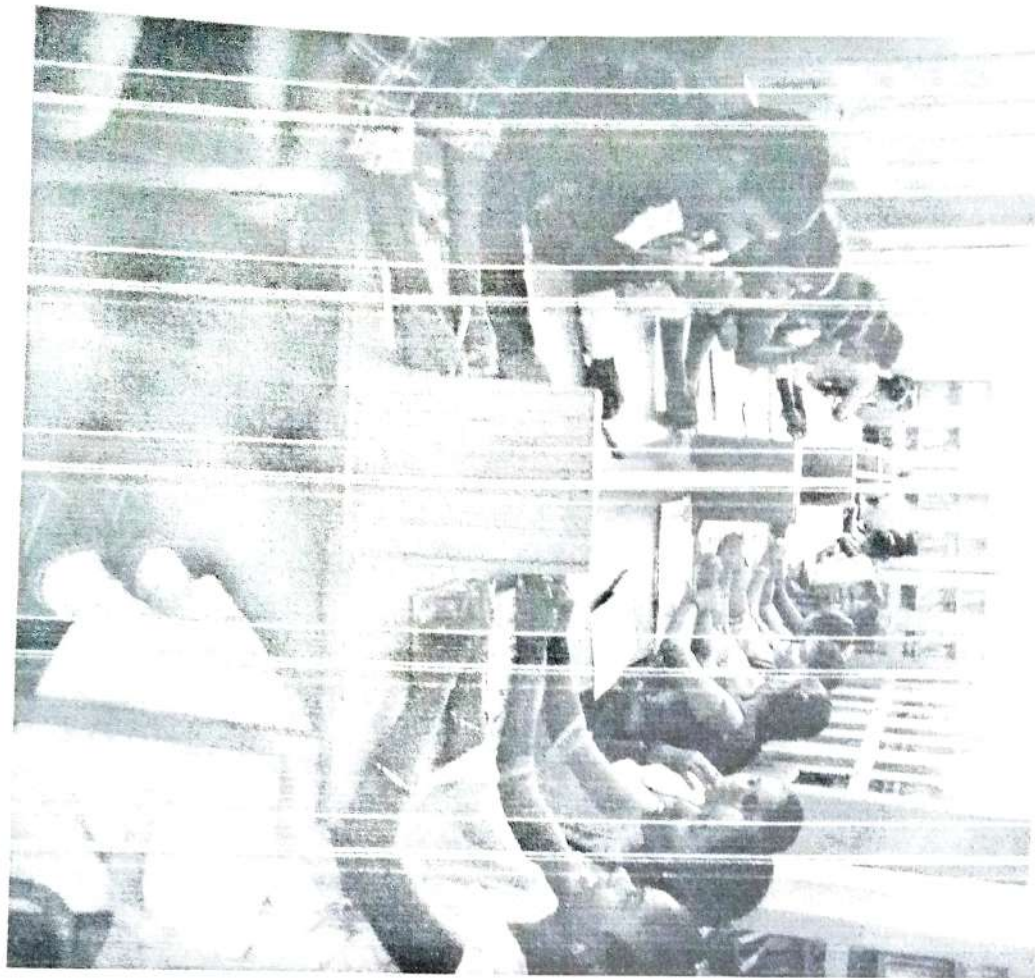
The teacher is always a busy man.