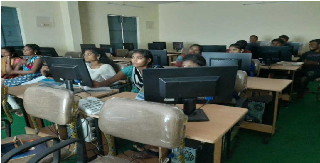
Explanation about speech organs while teaching phonetics