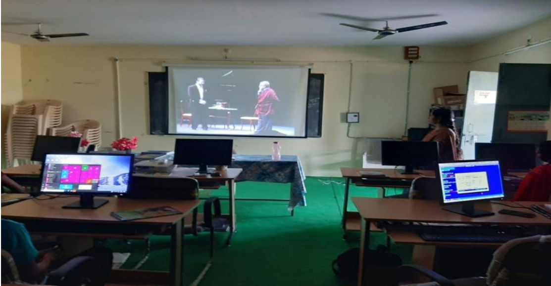
Students watching “The Proposal” lesson video