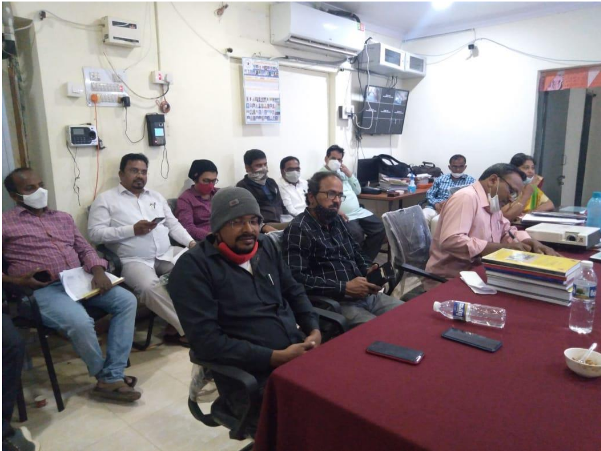
Participants listening to the presentation

Principat(FAG) PRINCIPAL TARA GOVT. COLLEGE AUTONOMOUS SANGAREDDY-502 001.