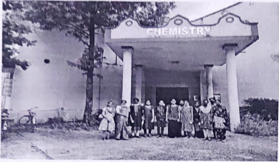
Department of chemistry