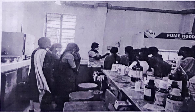
students interact with project supervisor