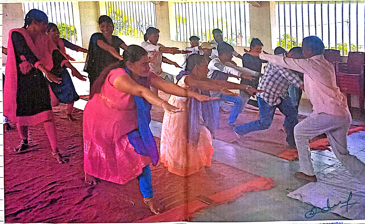
PRINCIPAL S.U.M. GOVT. DEGREE COLLEGE KONDANAGULA - 509 401.