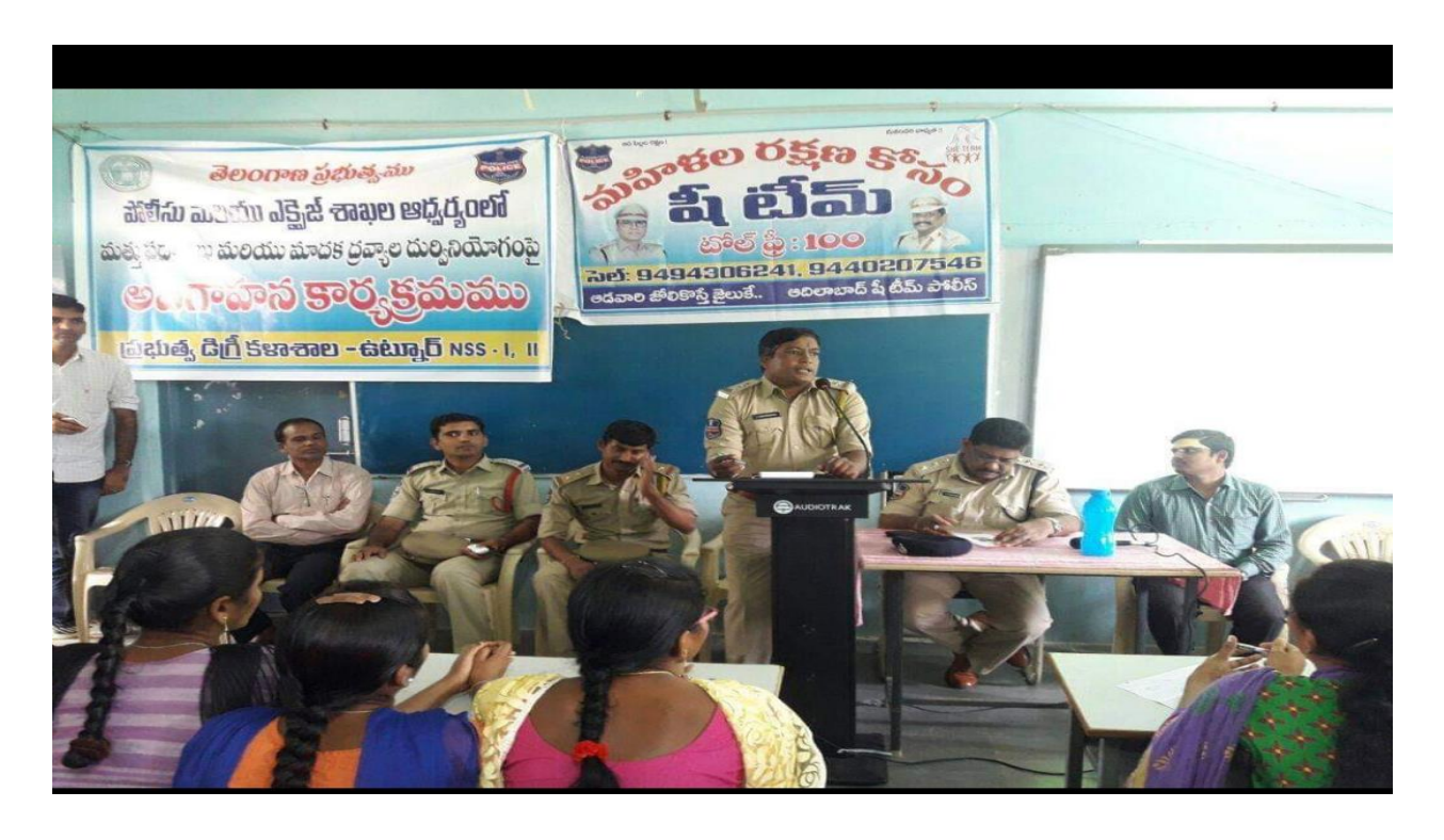
Health awareness program on Drug abuse by Excise and Police department: