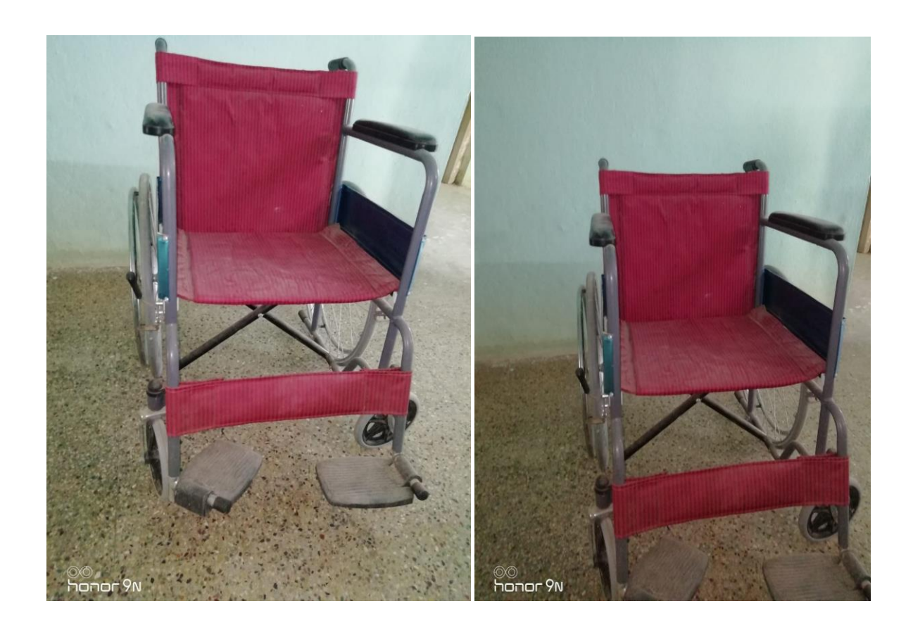
Wheel chair facility for physically challenged people