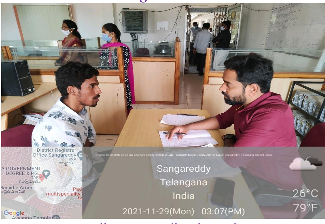
Applicant attending interview