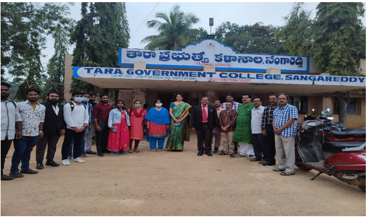
A glimpse with all employers and the personnel of Magic Bus Foundation