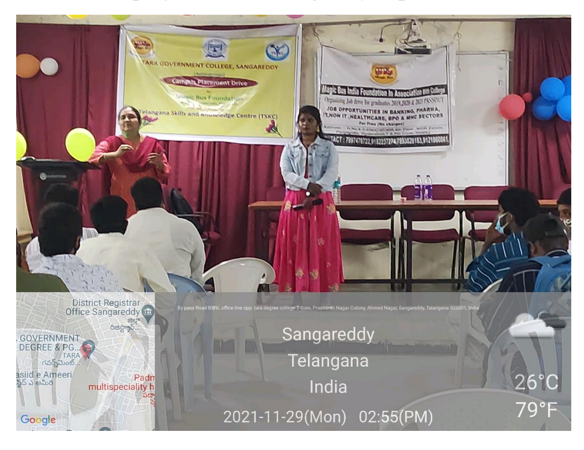
HR executives addressing the participants as part of the inaugural session of the Job Mela