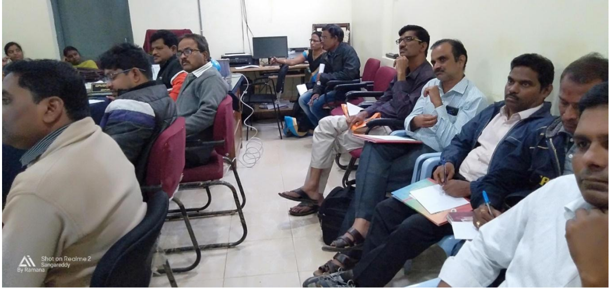
Staff attending the session and noting the points