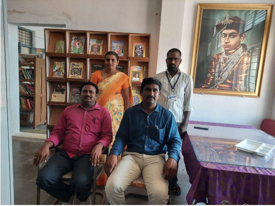
Library Staff Photo with Principal