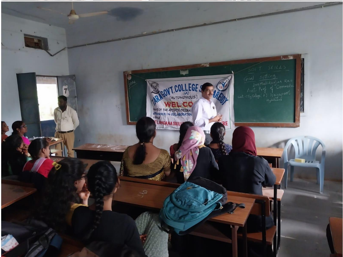
The resource person interacting with students