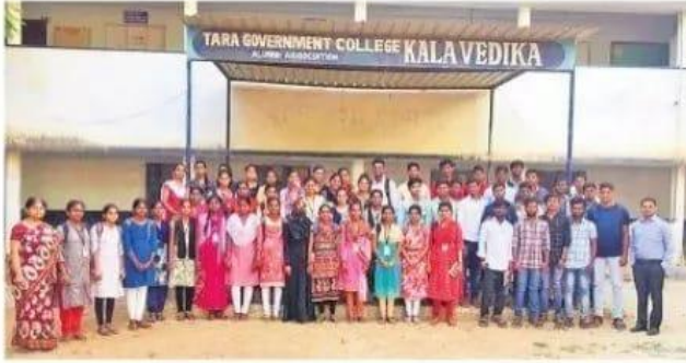
శిక్షణ పొందిన విద్యార్థులు