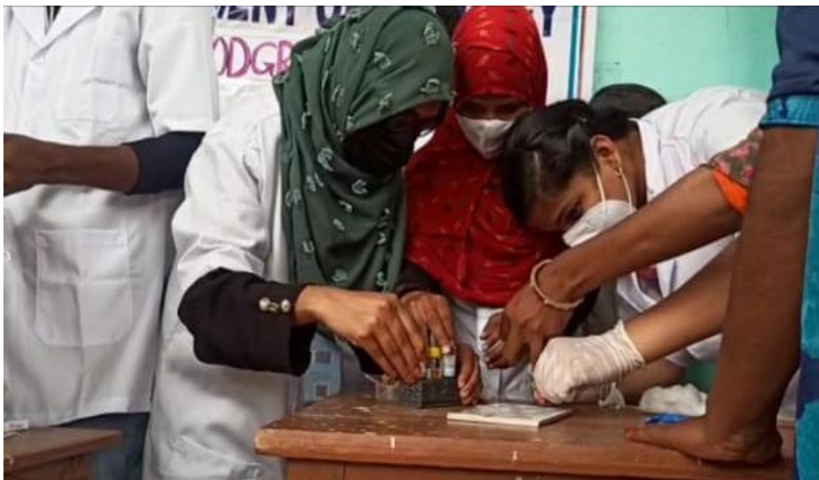
M.A.L.D COLLEGE RRC MEMBERS AND STUDENTS