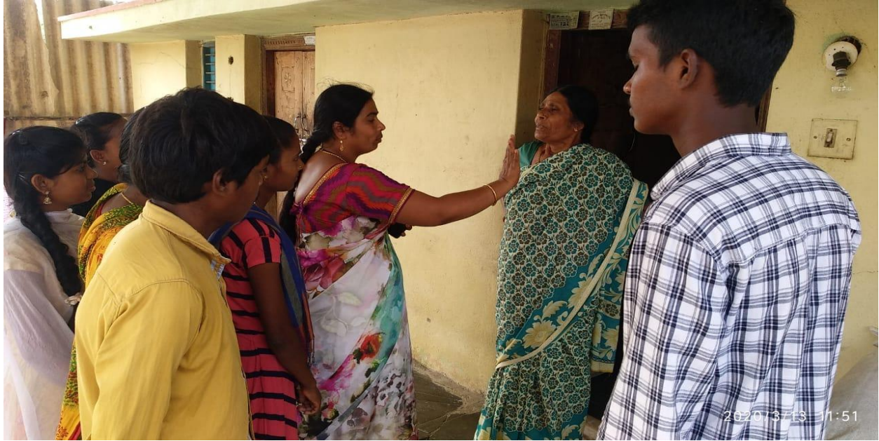
NSS SPECIAL CAMP AWARENESS ON KARONA VIRUS