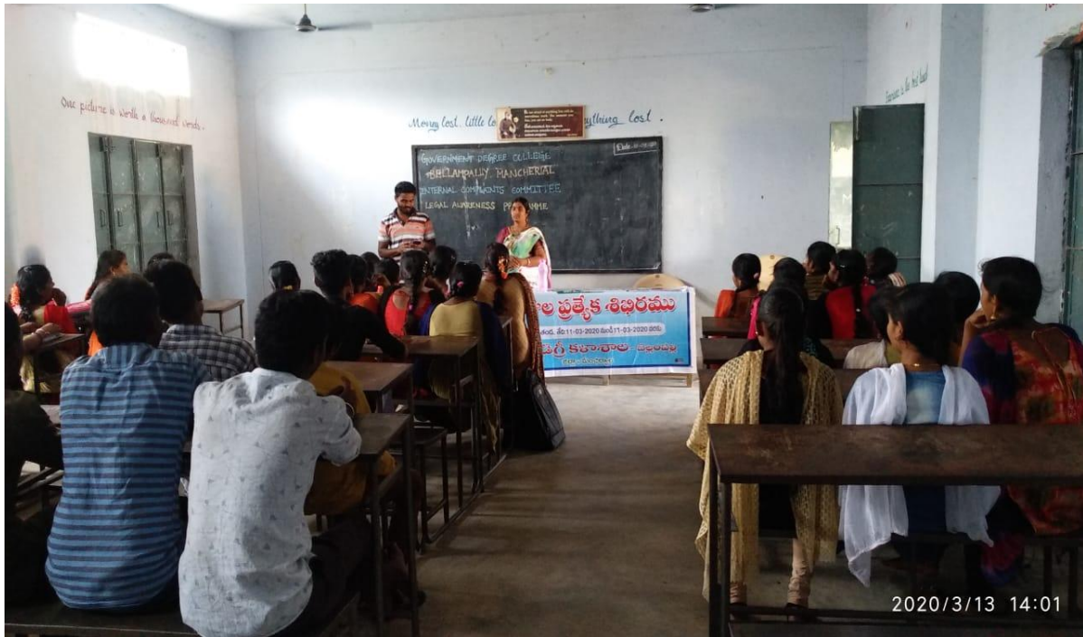
NSS SPECIAL CAMP EVENING SESSION CONDUCTED CULTURAL COMPETITIONS