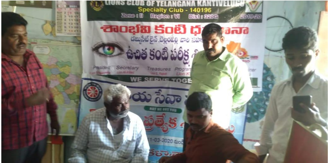
NSS CAMP ORGANISED A FREE EYE TESTING CAMP AT VILLAGE