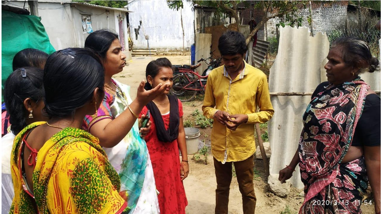
NSS SPECIAL CAMP AWARENESS ON KARONA VIRUS