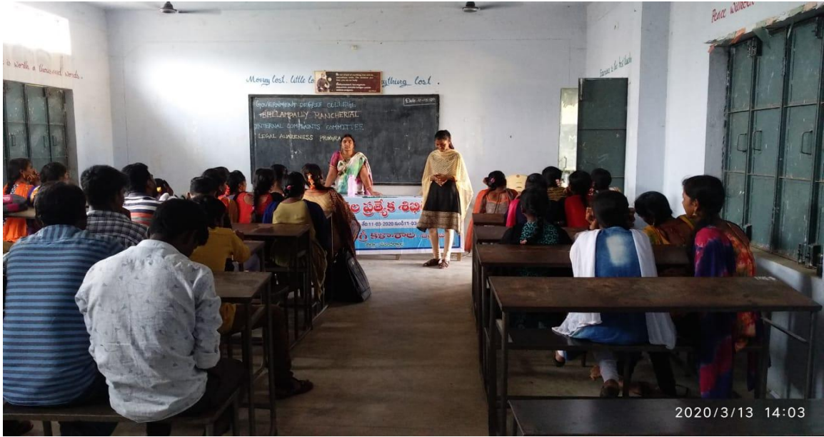
NSS SPECIAL CAMP EVENING SESSION CONDUCTED CULTURAL COMPETITIONS