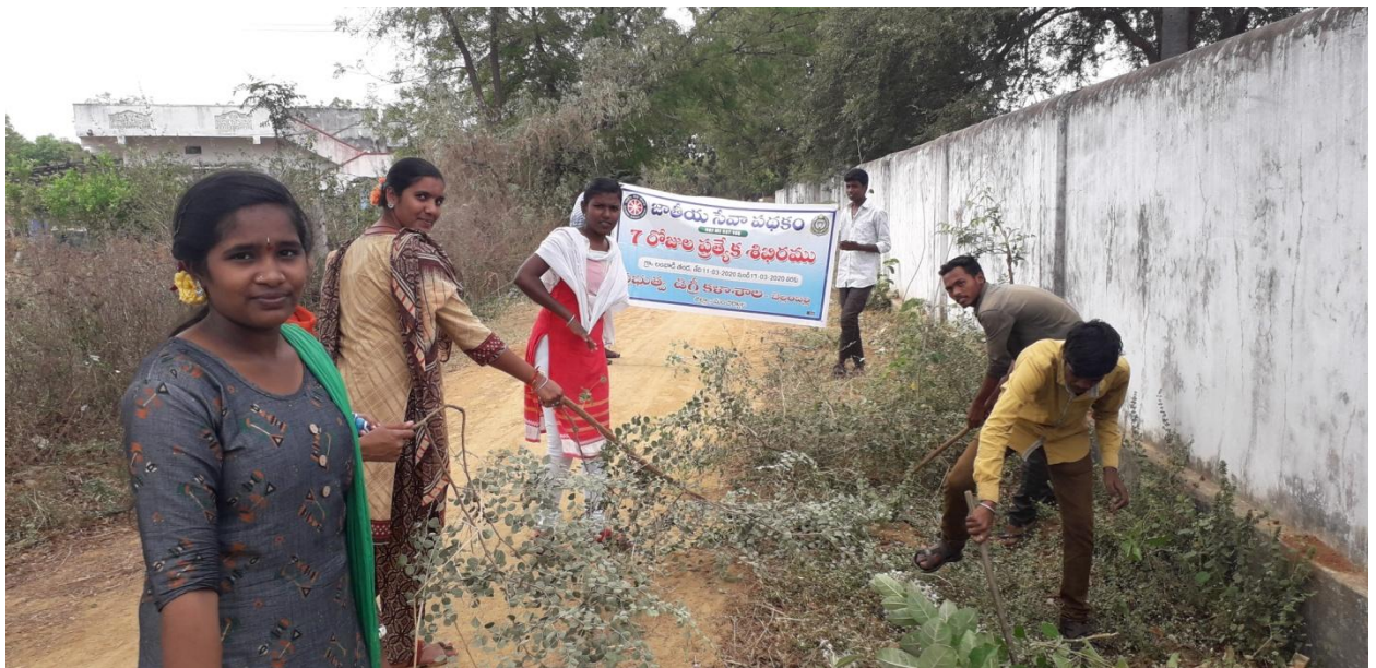
NSS SPECIAL CAMP SHRAMADHAN PROGRAMME