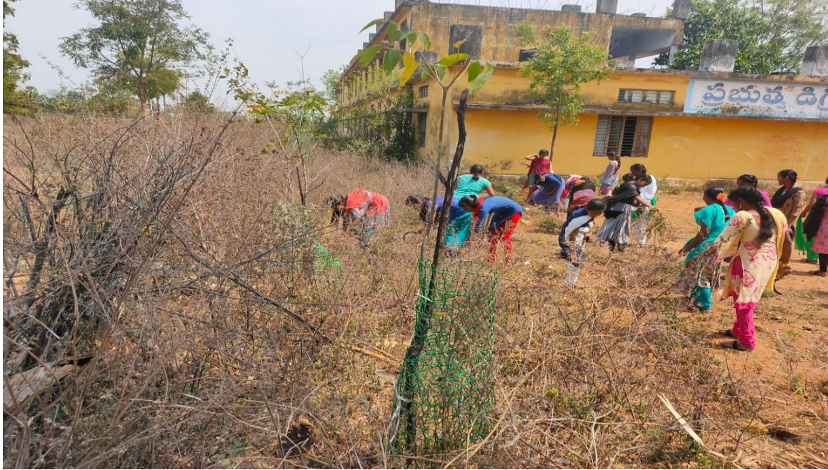
NSS SPECIAL CAMP SHRAMADHAN PROGRAMME