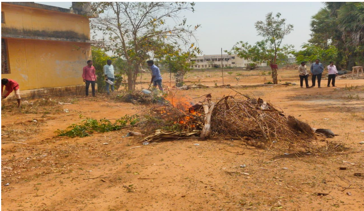
NSS SPECIAL CAMP SHRAMADHAN PROGRAMME