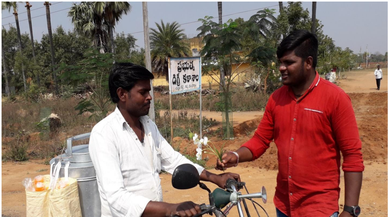
NSS CAMP ROAD SAFTY AWARENSS CAMPAIGN