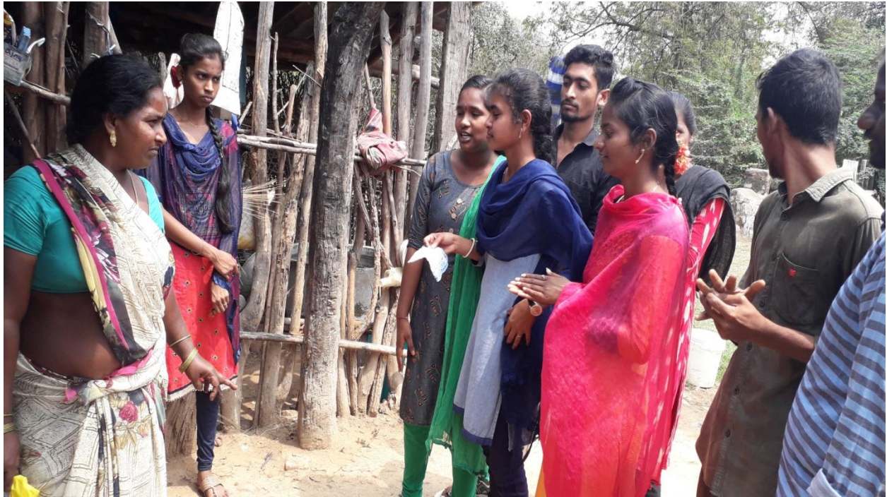
NSS SPECIAL CAMP AWARENESS ON CARONA VIRUS