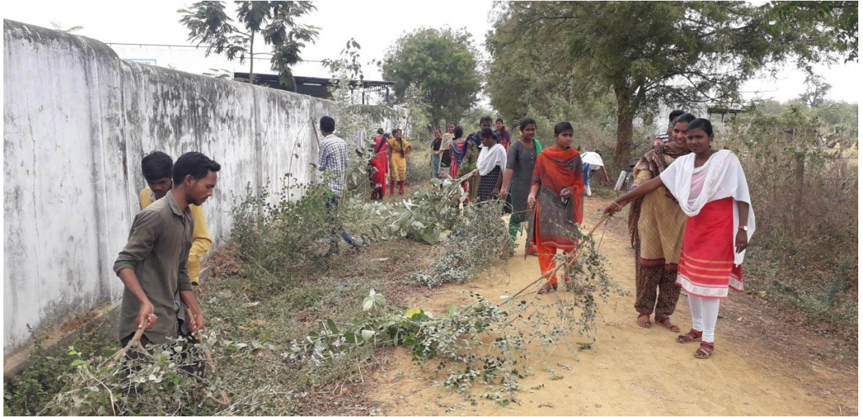
NSS SPECIAL CAMP SHRAMADHAN PROGRAMME