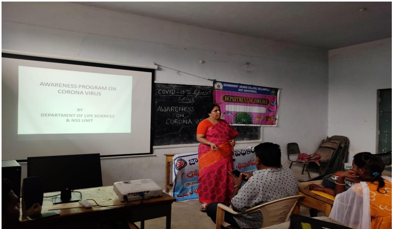
NSS SPECIAL CAMP EXTENTION LECTURE ON CARONA VIRUS