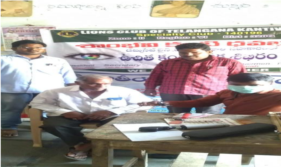
NSS CAMP ORGANISED A FREE EYE TESTING CAMP AT VILLAGE