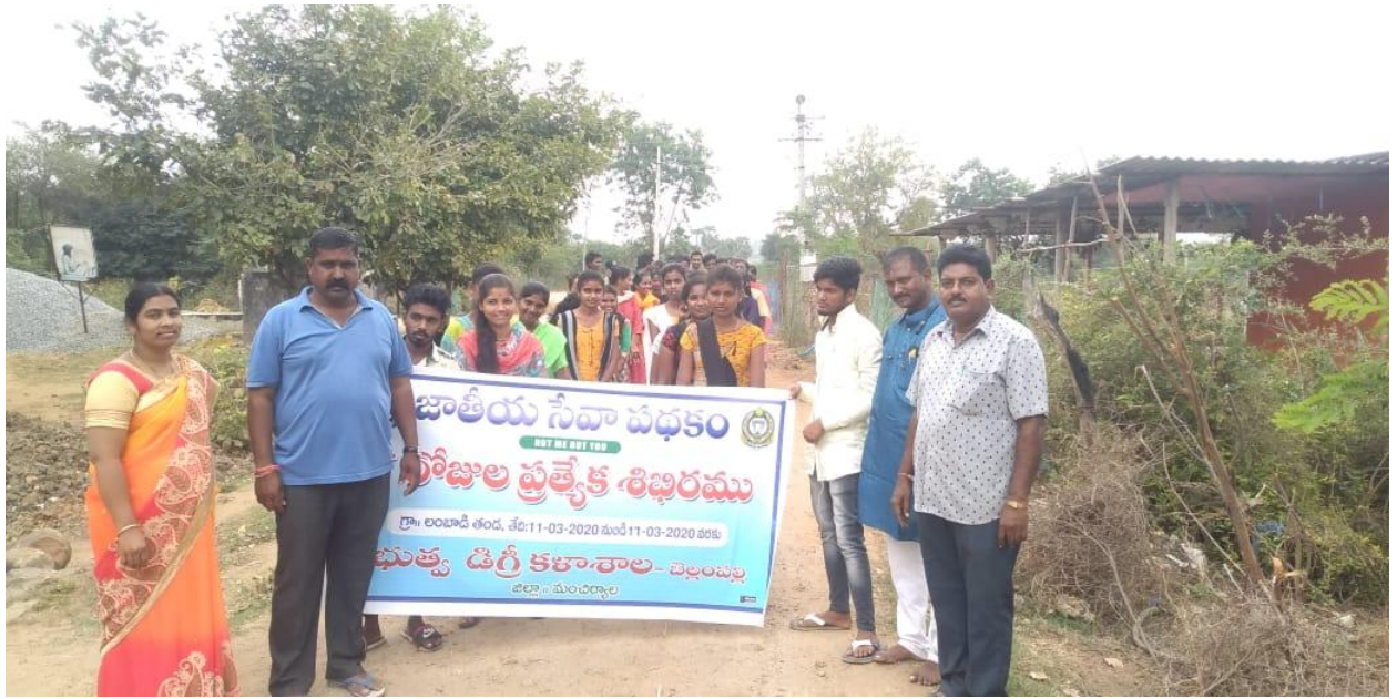
NSS SPECIAL CAMP AWARENESS RALLY WITH SARPANCH