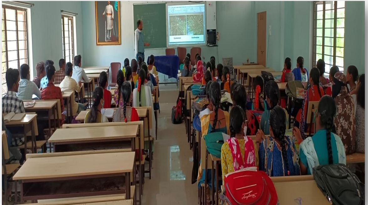
VIRTUAL CLASS ROOM