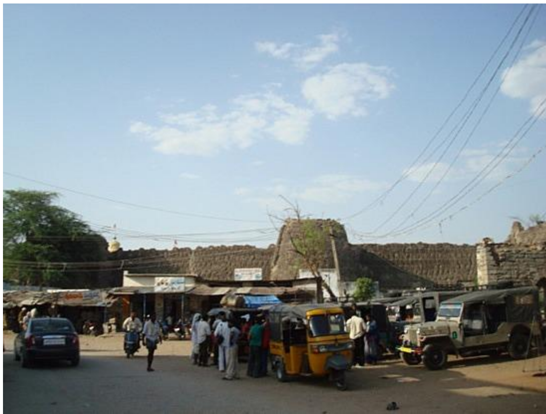
The Fort of Gadwal from Outside