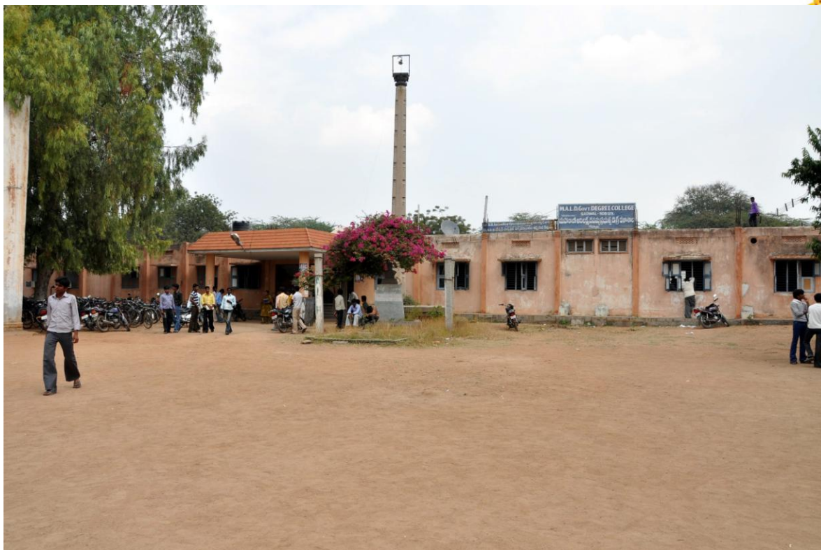
The Main building of the M.A.L.D.Govt. Degree College, Gadwal.