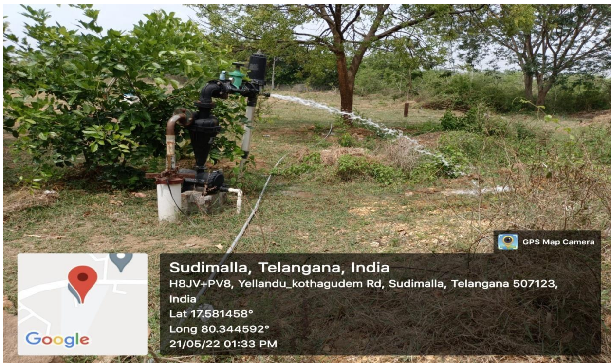
Rain water harvesting through bore well

The college has maintained liquid waste management in the following ways in the premises.