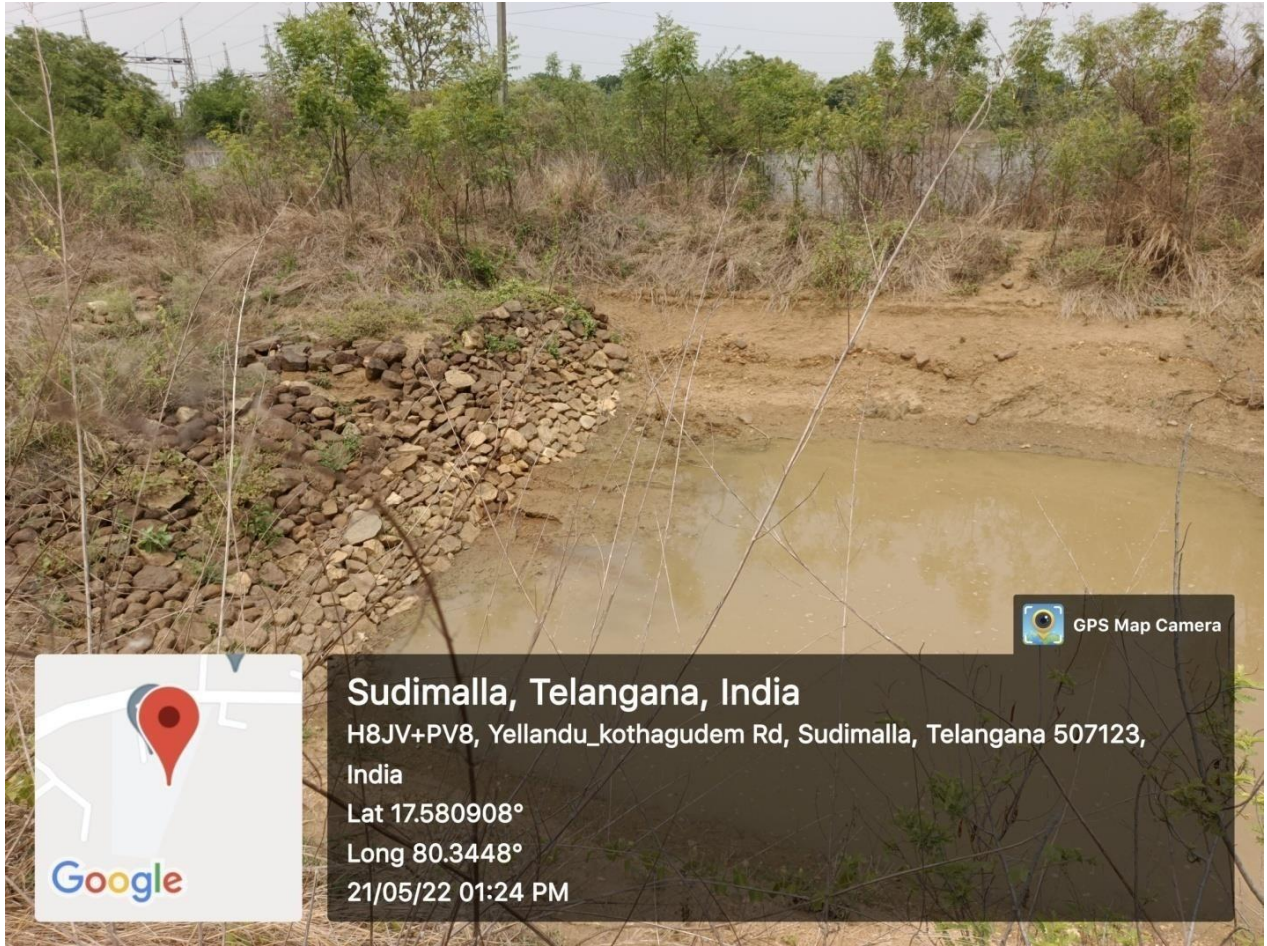
Rain water preserved in the water pond.