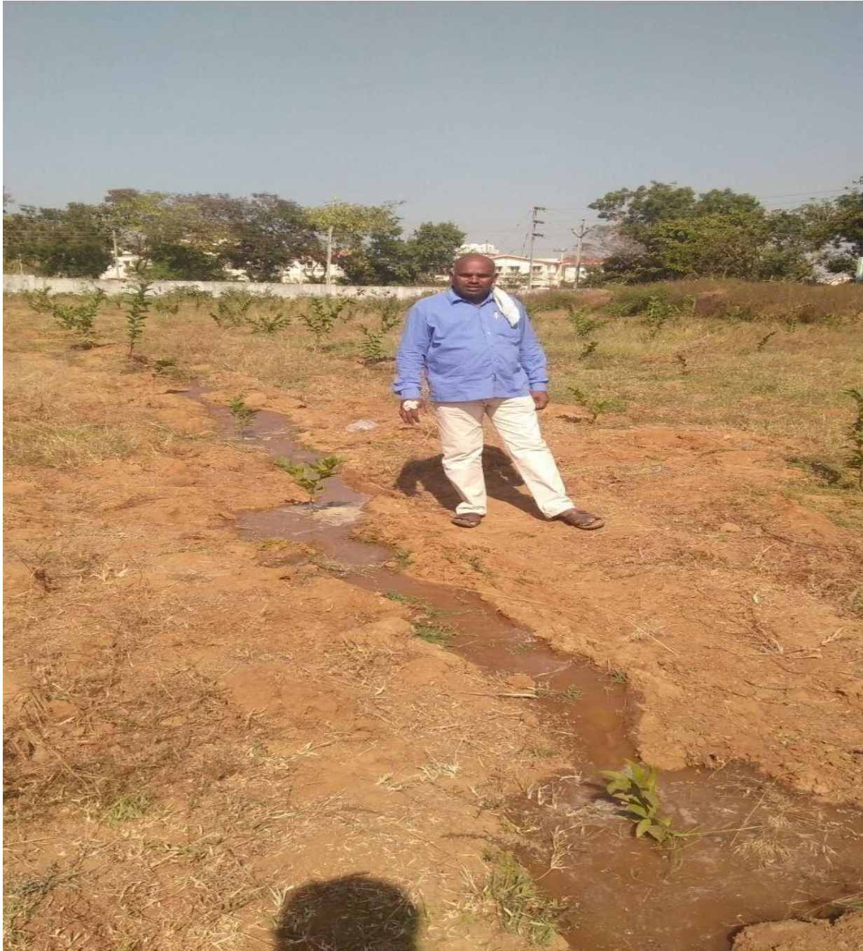
Waste water management -watering the plants.