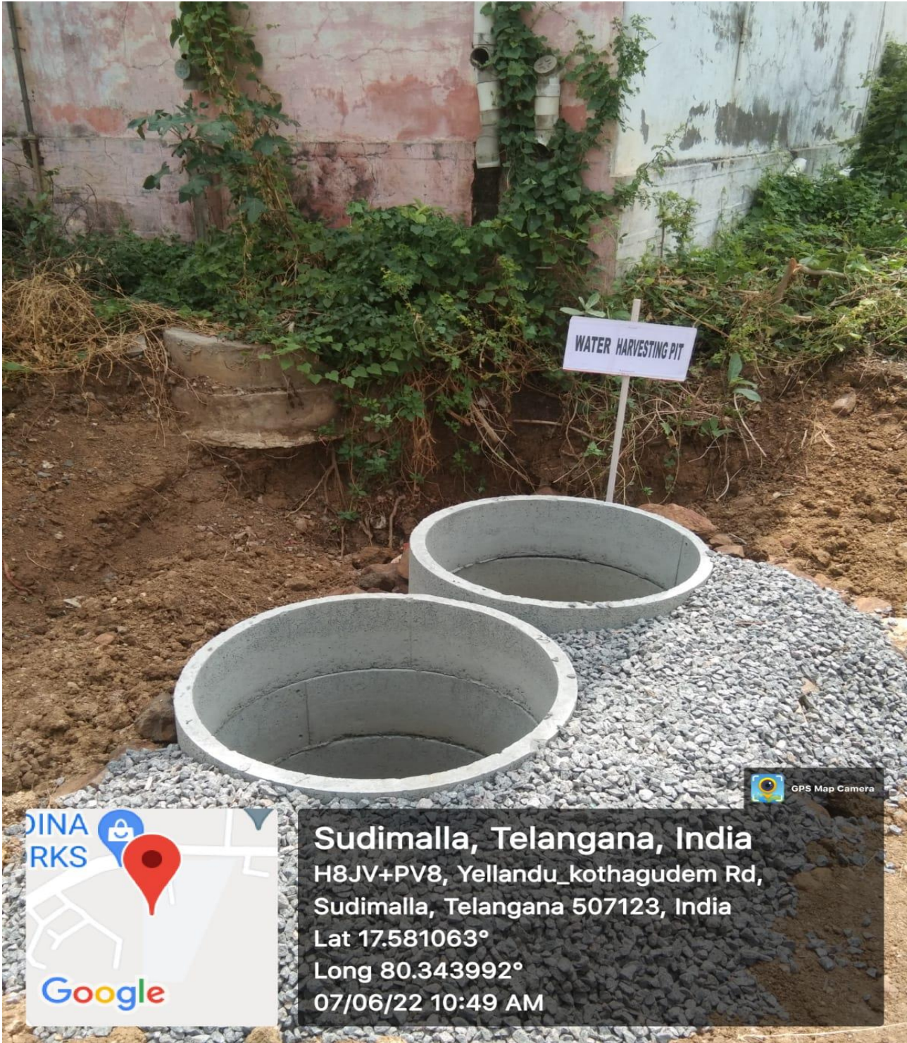
Water harvesting pit to improve the ground water