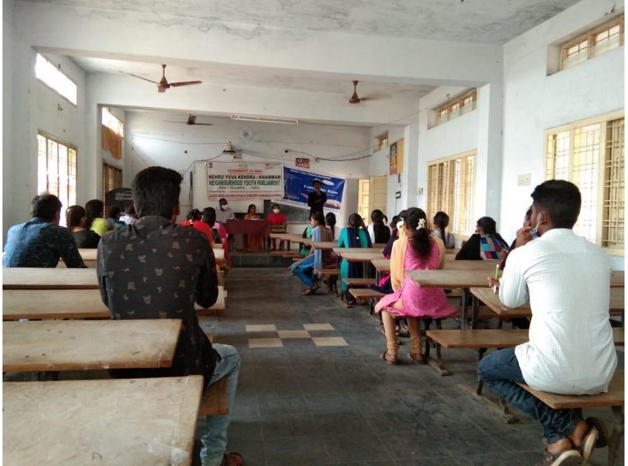
Awareness programme on water conservation conducted by Nehru Yuvakendra, Khammam