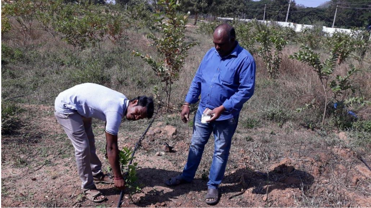
College has drip irrigation facility for plantation.