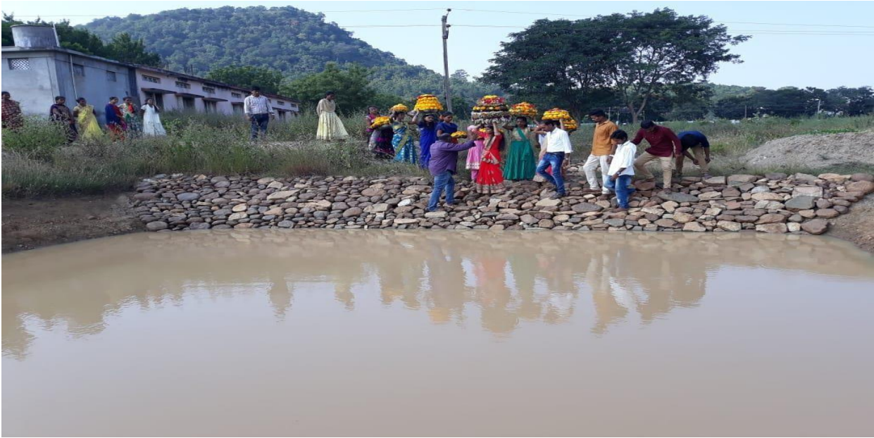
Rain water preserved in the water pond.

Sudimalla, Telangana, India H8JV+PV8, Yellandu_kothagudem Rd, Sudimalla, Telangana 507123, India Lat 17.580945° Long 80.344804° 21/05/22 01:22 PM