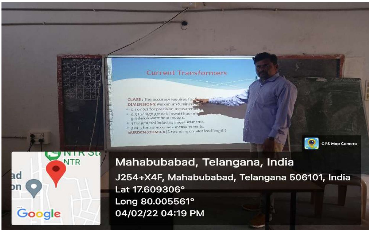
Fig.4. Digital Classroom Installed in Room No.9. In the same way In Seminar Hall and Room No:10 are also equipped with digital Classrooms