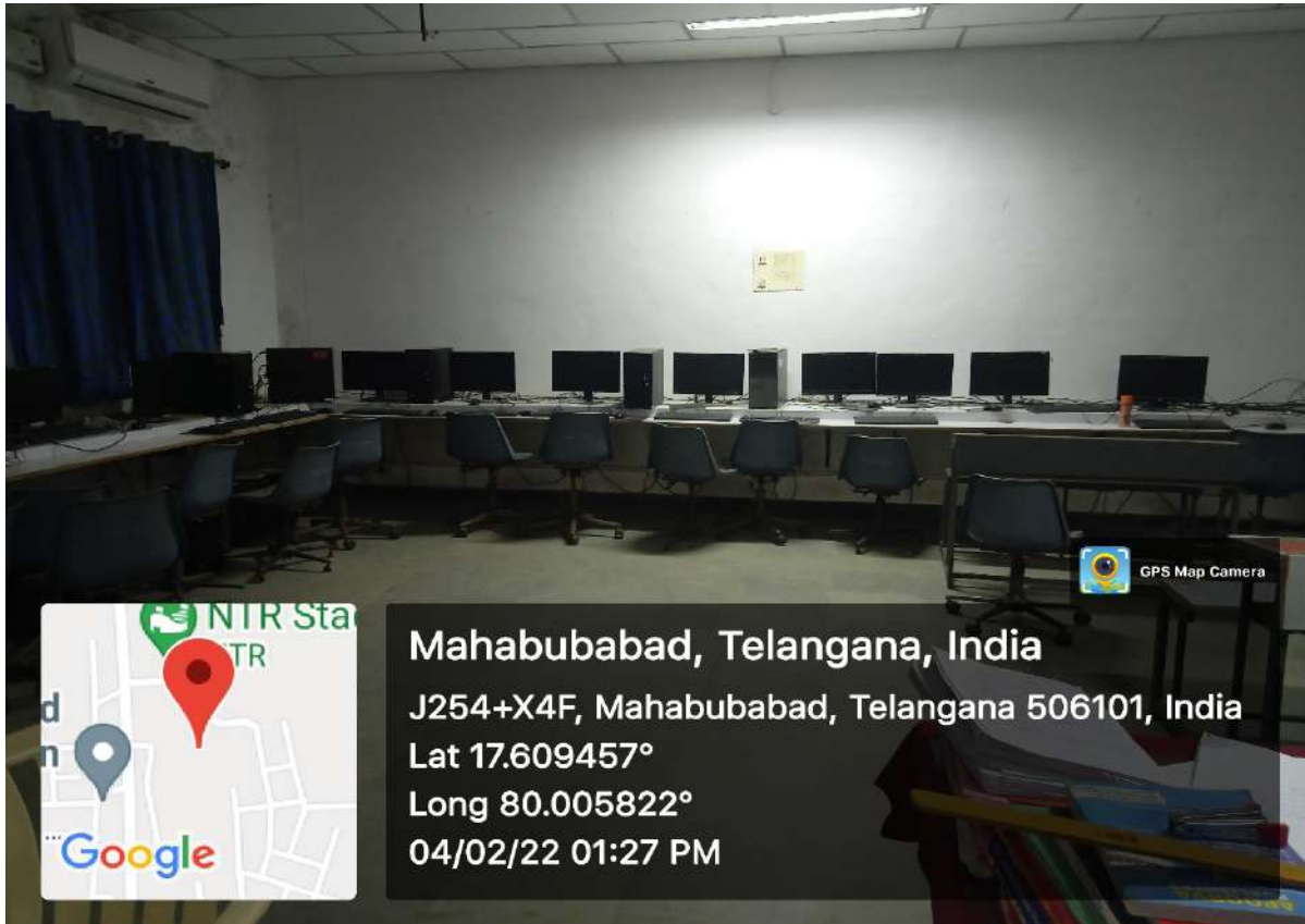
Fig.1. Computer Applications Lab