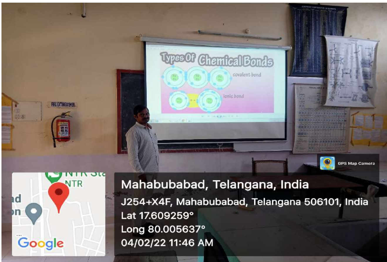
Fig.5. LCD Projector Installed in Chemistry Lab.

In the Same way, Physics, Computer Science, Compute Applications, Botany, Zoology labs are equipped with LCD Projectors. Classes were also engaged in respective labs.