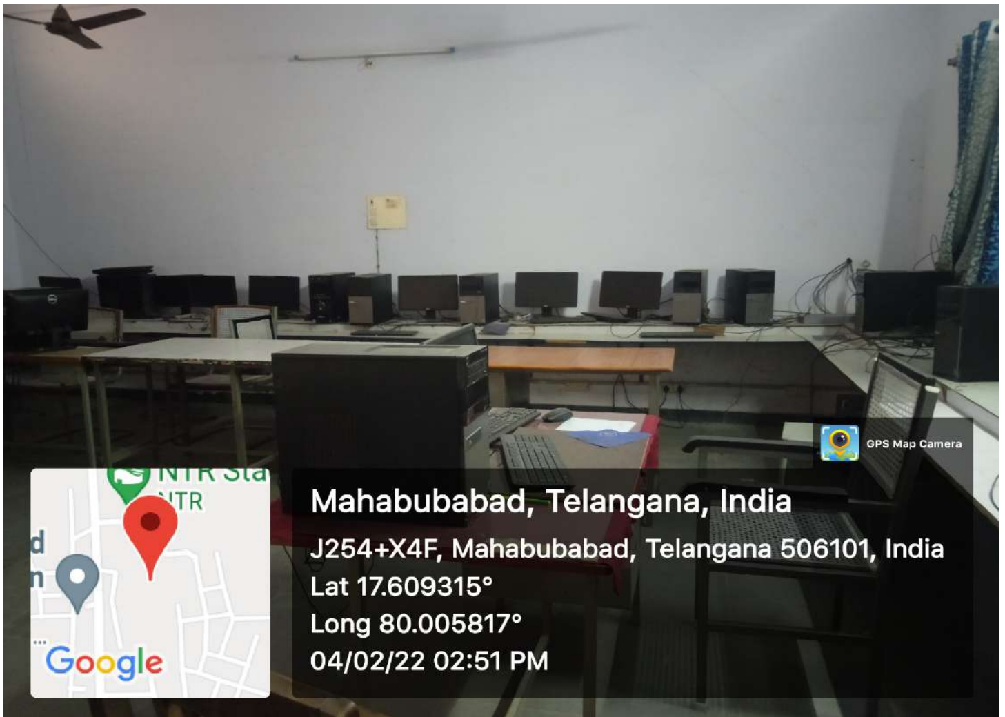
Fig.3. Computer Science Lab