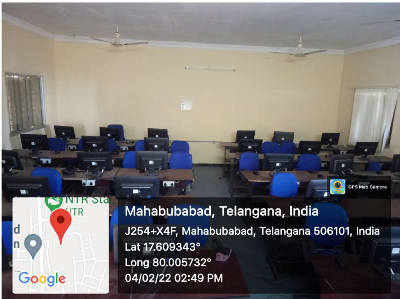
Fig.2. TSKC and English Language Lab