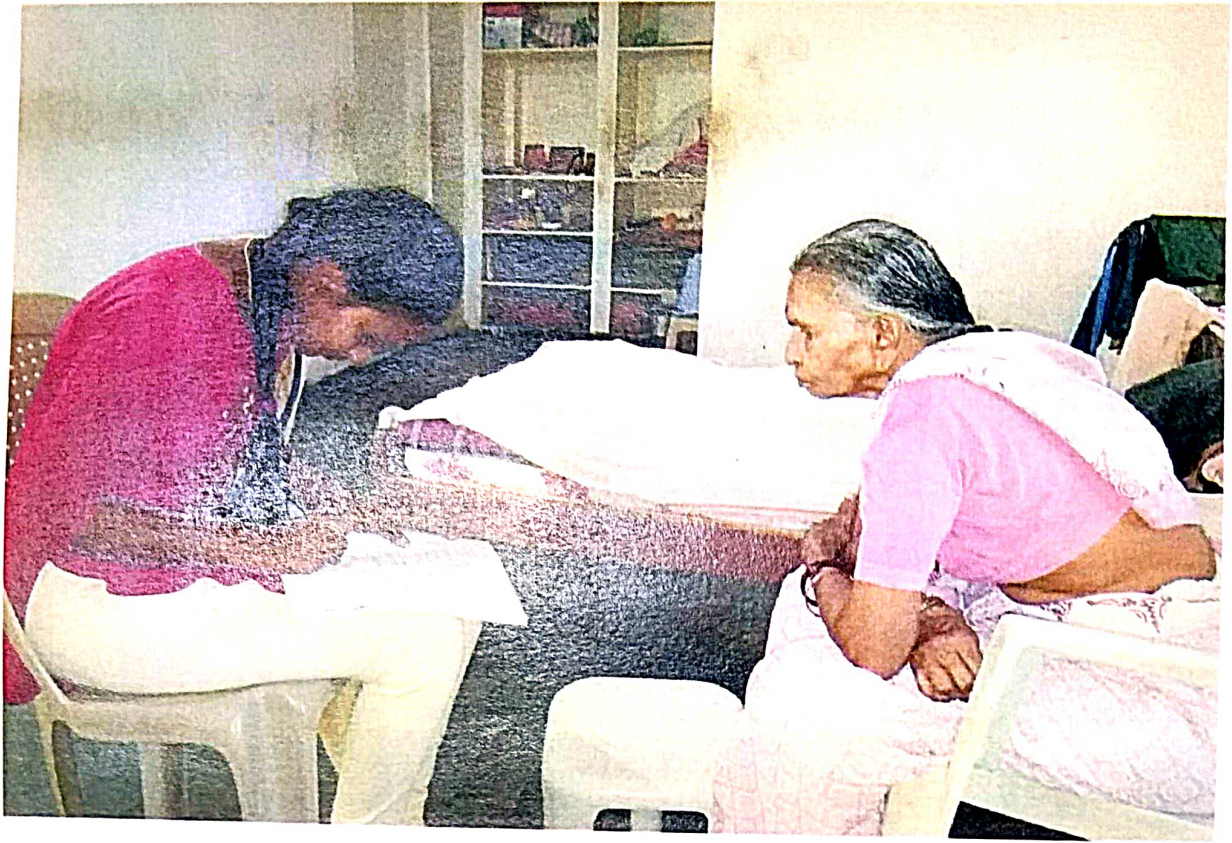
Students interacting with the people in oldage home