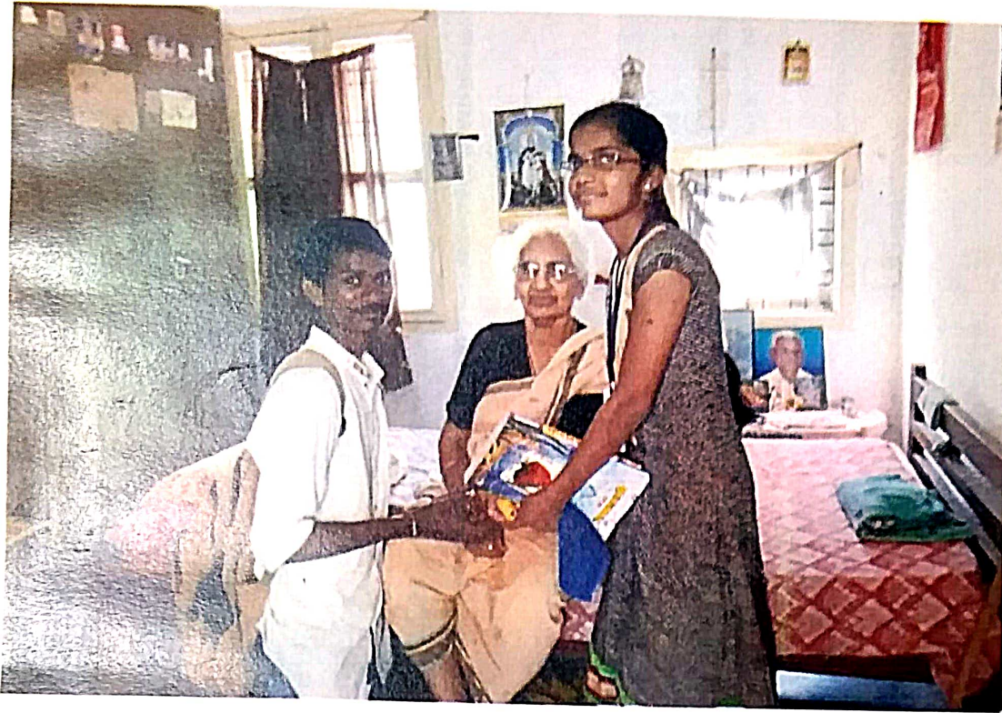
Students distributing the fruits to the elderly people