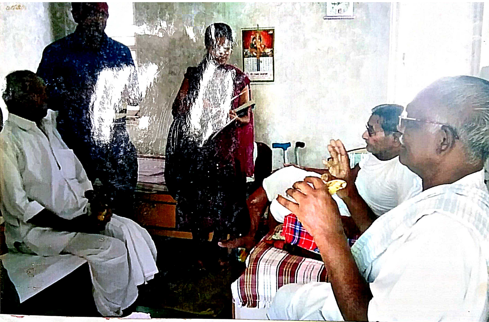
Elderly Inmates explaining their situation in the Old-age home