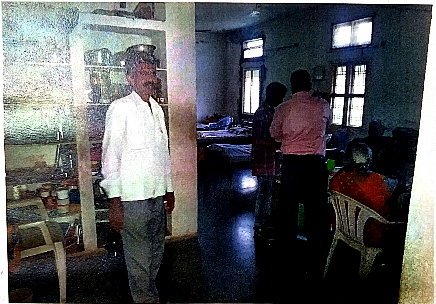
Fruit distribution to elderly people