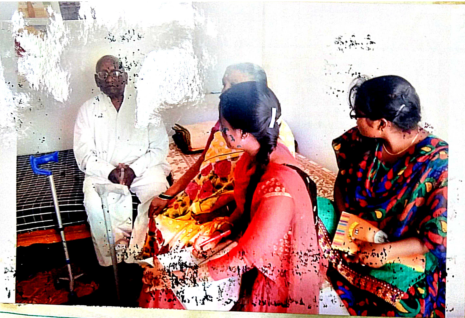
An elderly couple sharing their concerns