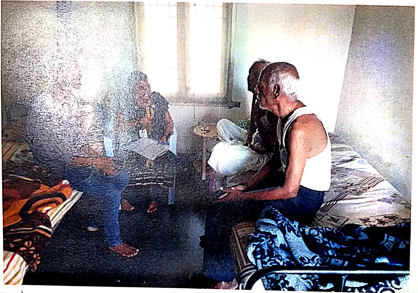
Students interacting with elderly people