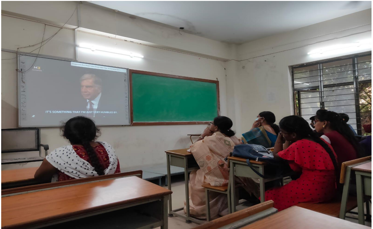
Motivational talk by Ratan Tata