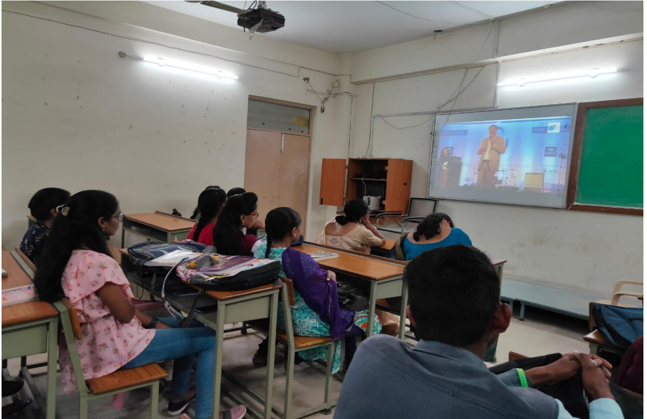
Inspirational speech by Boman Irani