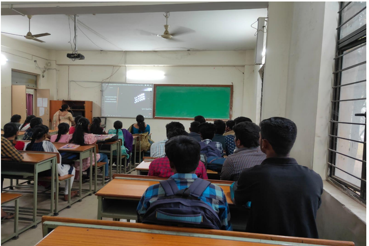
A video on ' Mind your language ' an entertainment series.