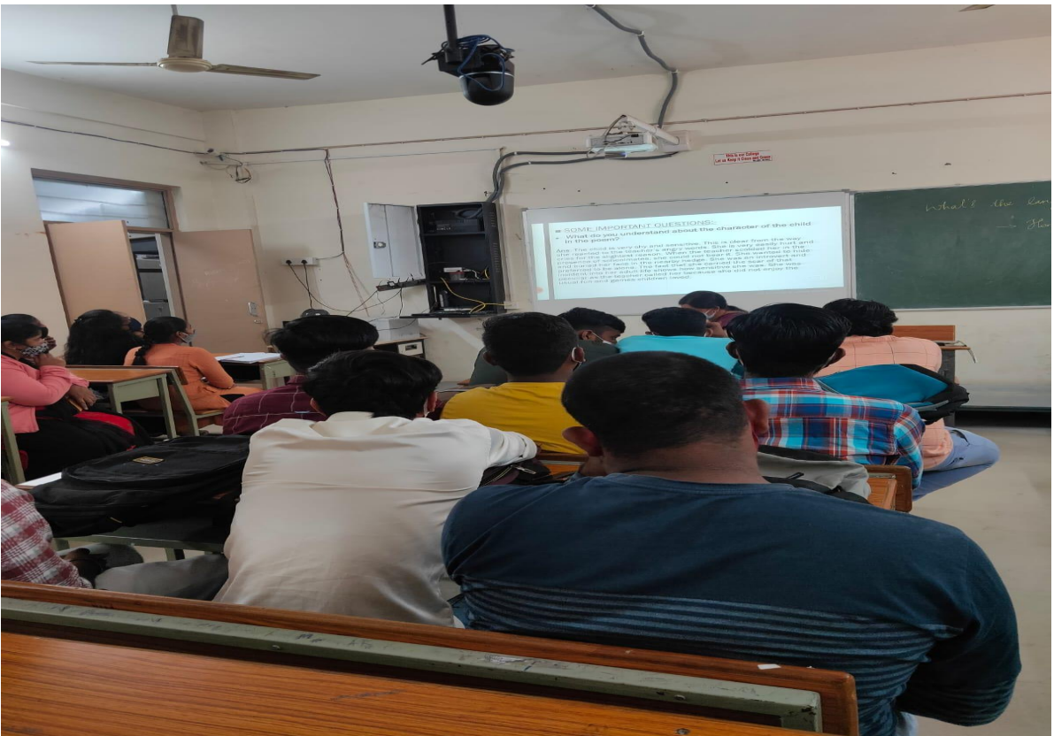
Motivational Speeches as part of Edutainment through Blended learning.