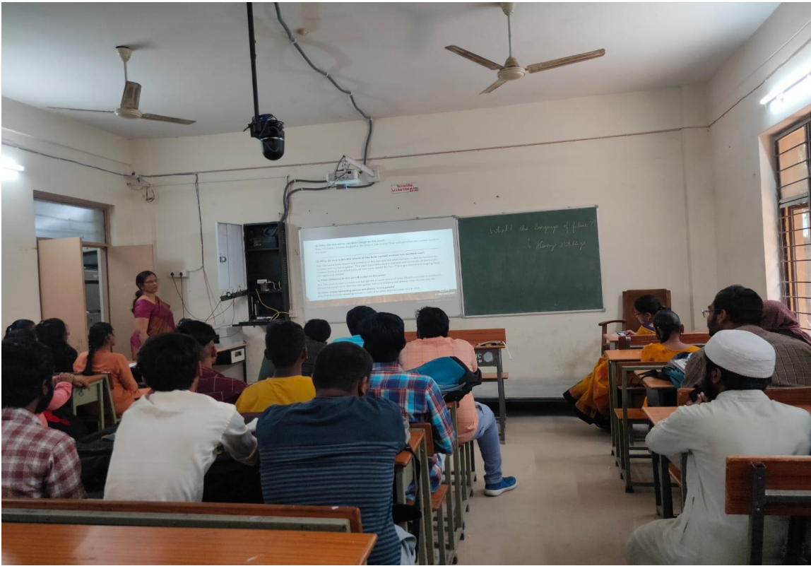
Motivational Speeches as part of Edutainment through Blended learning.