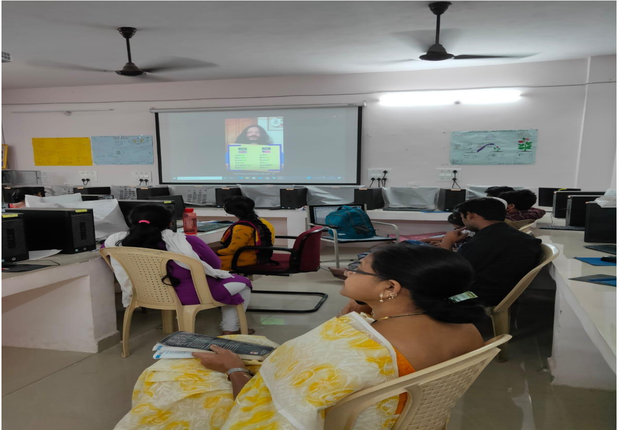
A class on pronunciation skills.