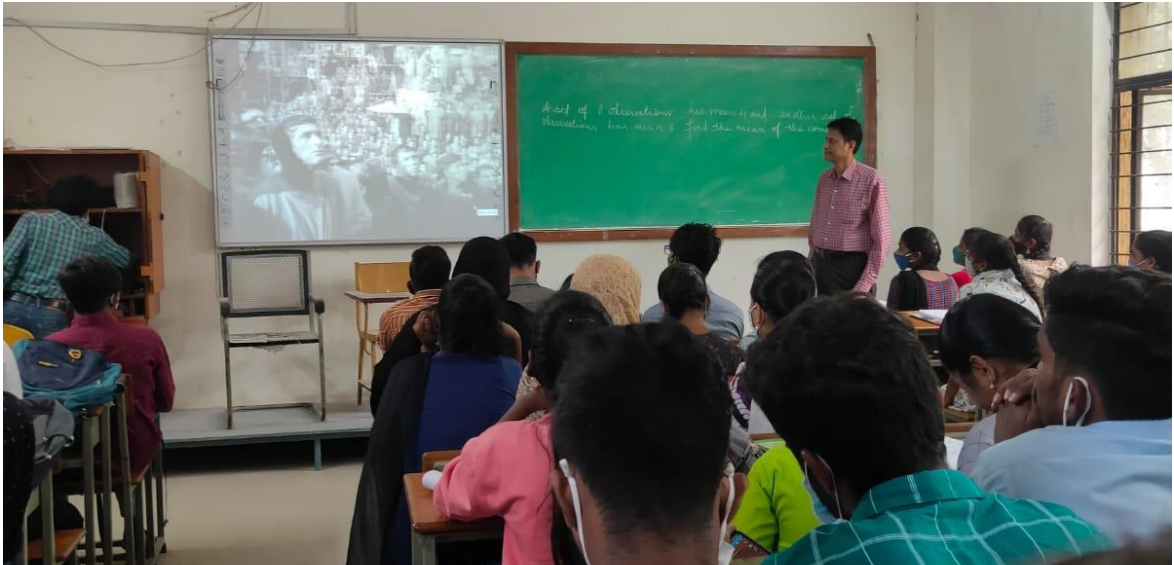
Speech from the play Julius Caesar.