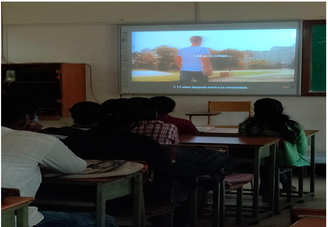
A video on ' Mind your language ' an entertainment series.