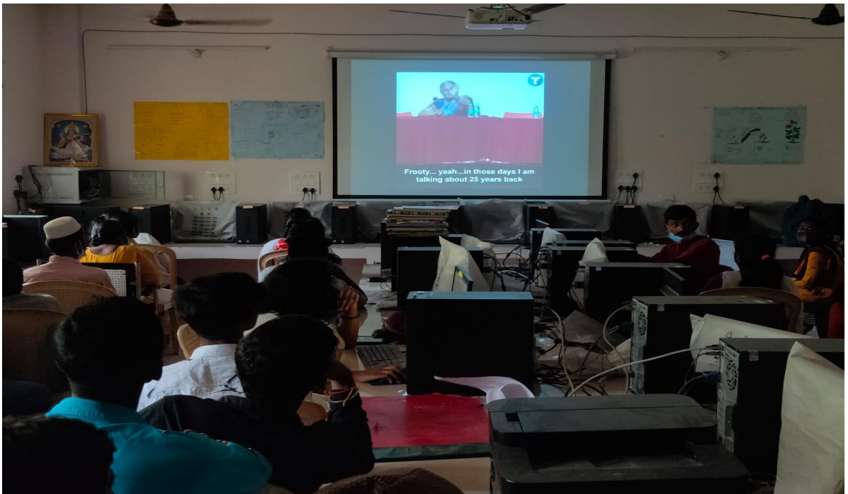
Inspirational speech by Sudha Murthy.