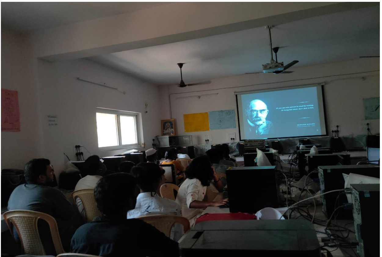
A class on pronunciation skills.