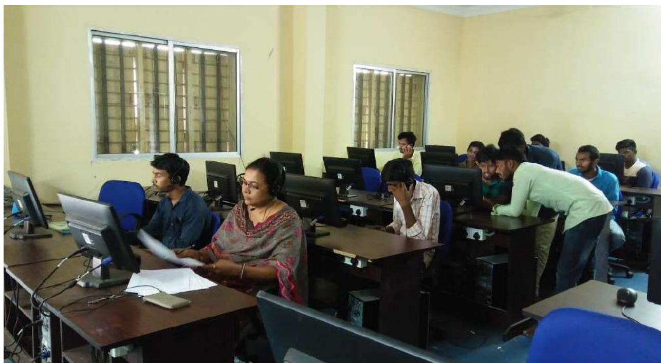
Hindi certificate course