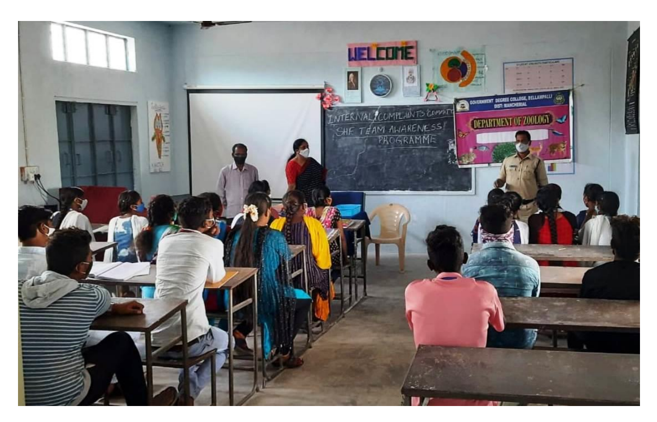
SHE Team Awareness Programme