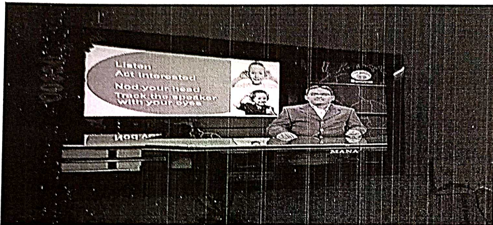
Students are watching MANA TV classes by the subject experts