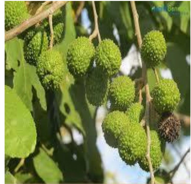
West Indian elm - Guazuma ulmifolia