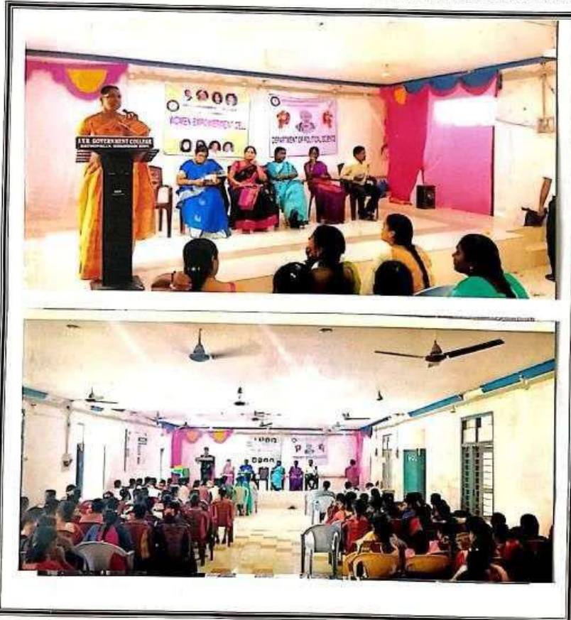
Photo Gallery Of One Day Workshop On "Prevention, Prohibition and Redressal of Women Harassment at Work Place"