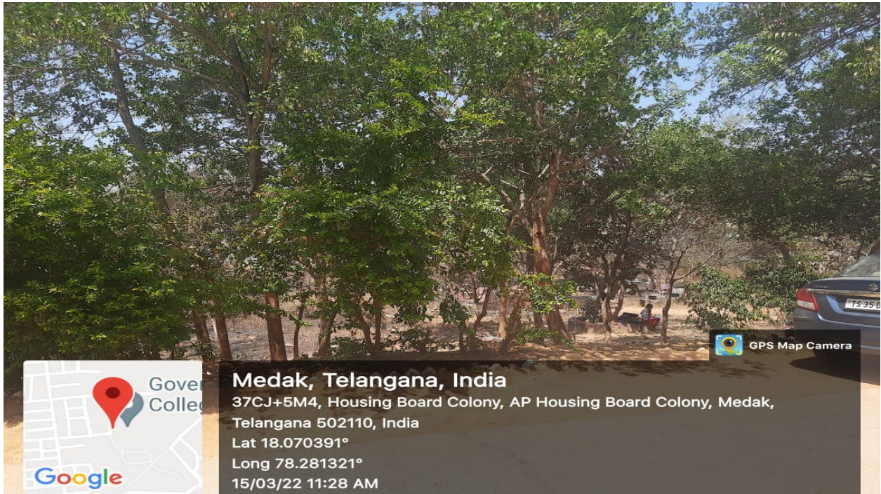
Greenery at the entrance