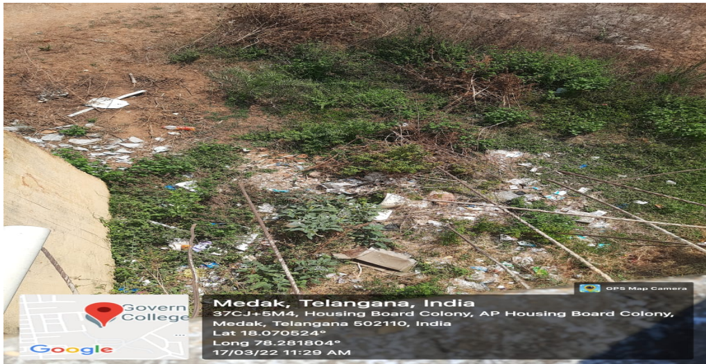
Bio degradable Waste