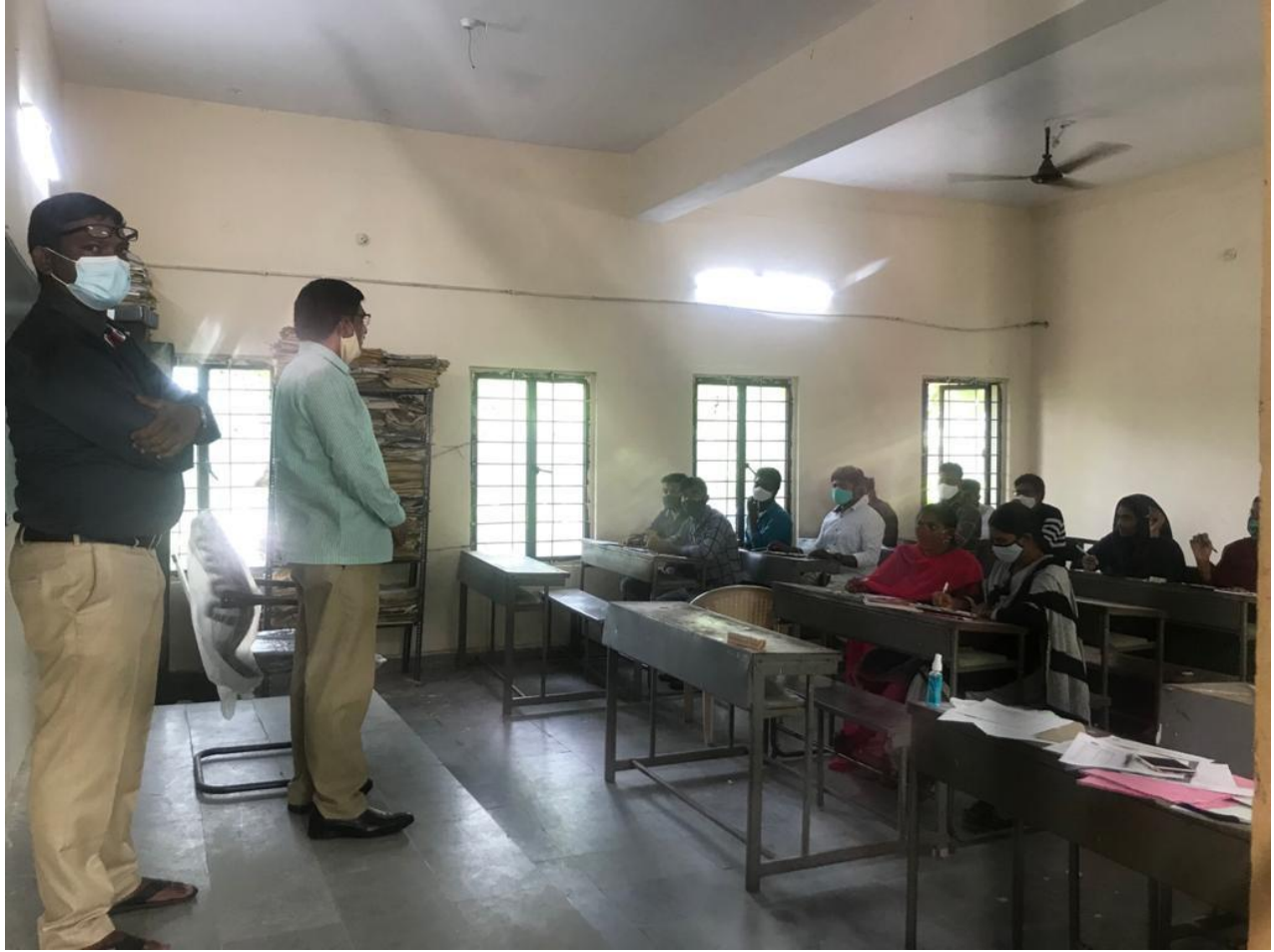
Principals talk on awareness | eradicating Covid- 19