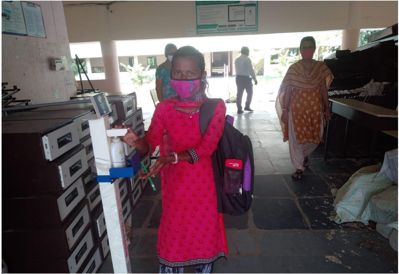
Sanitization Measures in the College Campus