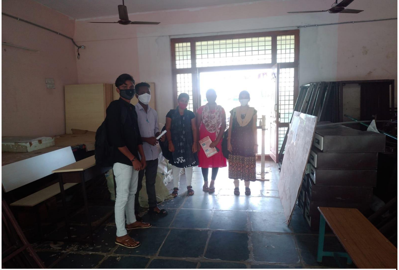
Awareness Program to the students on eradication of Covid- 19