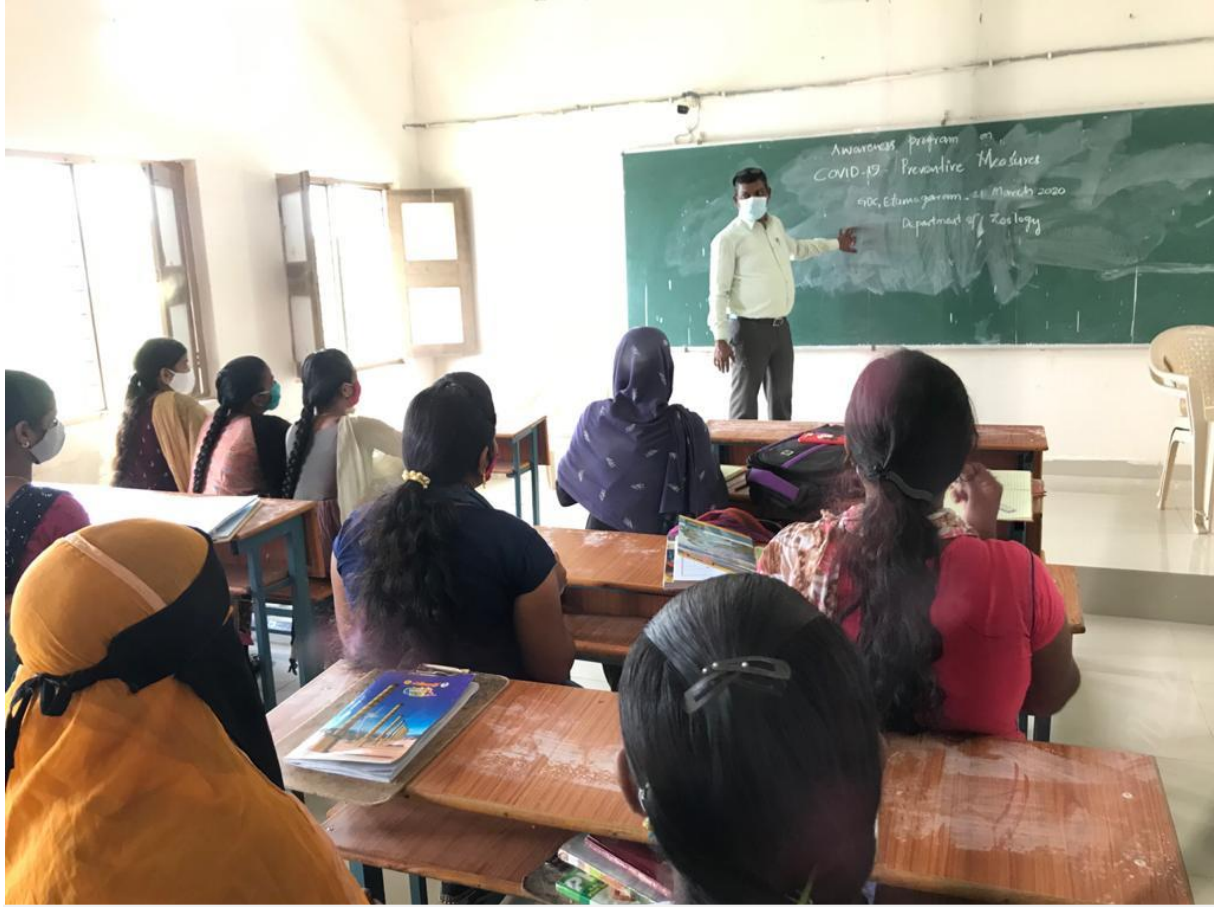
Awareness Program to the students on eradication of Covid- 19