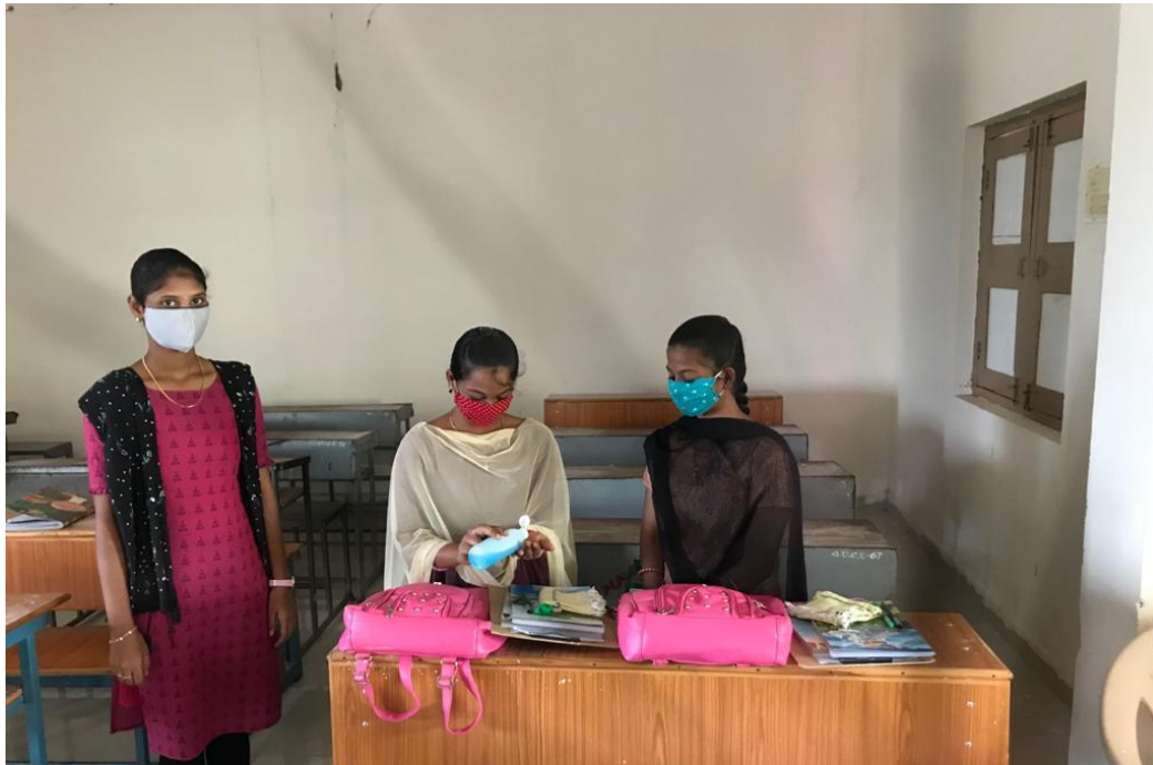
Wearing Masks in college campus