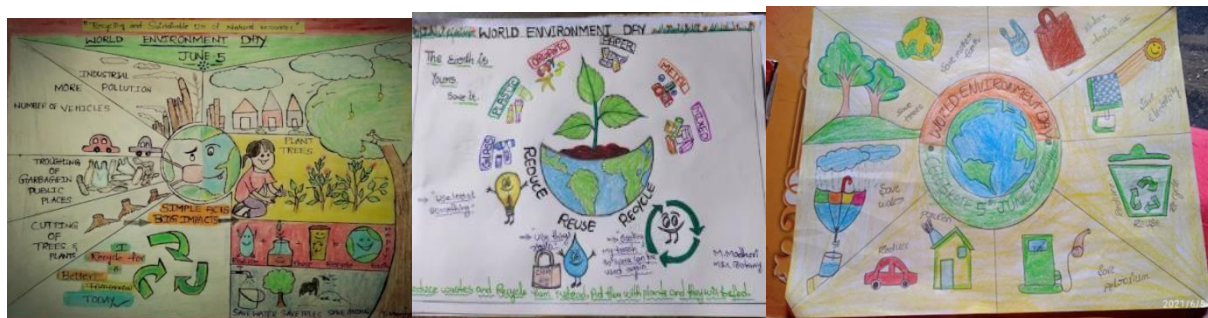
Some posters drawn by participants