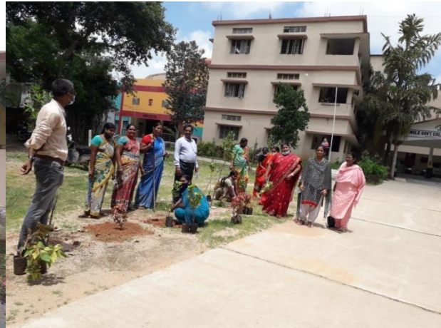
Plantation on 17-07-2021