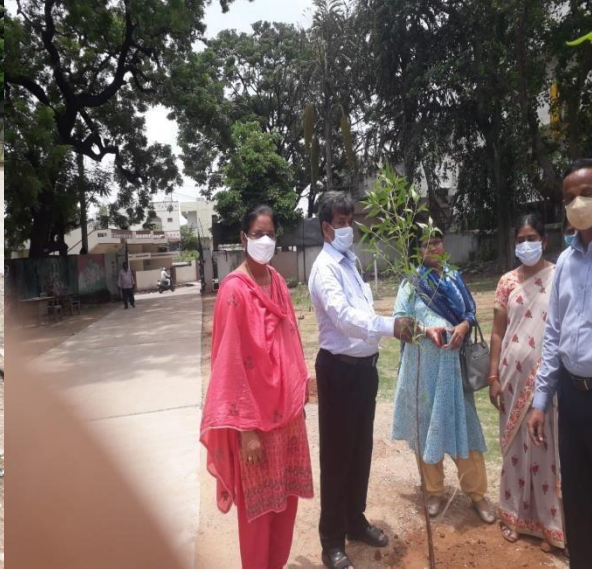
Plantation on 25-06-2021