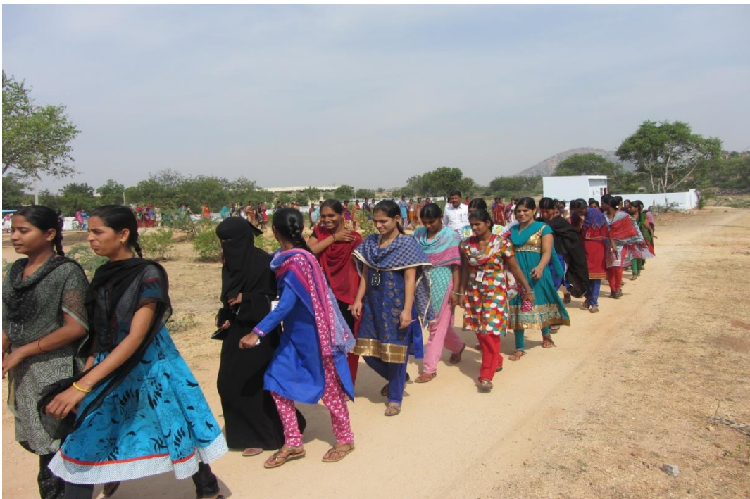
Awareness rally on AIDS

Red Ribbon Club, MKR Government Degree College, Devarakonda conducted an awareness rally on the occasion of World Aids Day on 01.12.2017 to bring awareness among the people about causes, mode of transmission, symptoms, treatment and precautions to be taken for control the AIDS. RRC members, students and staff of the college made this programme as successful one by their active involvement