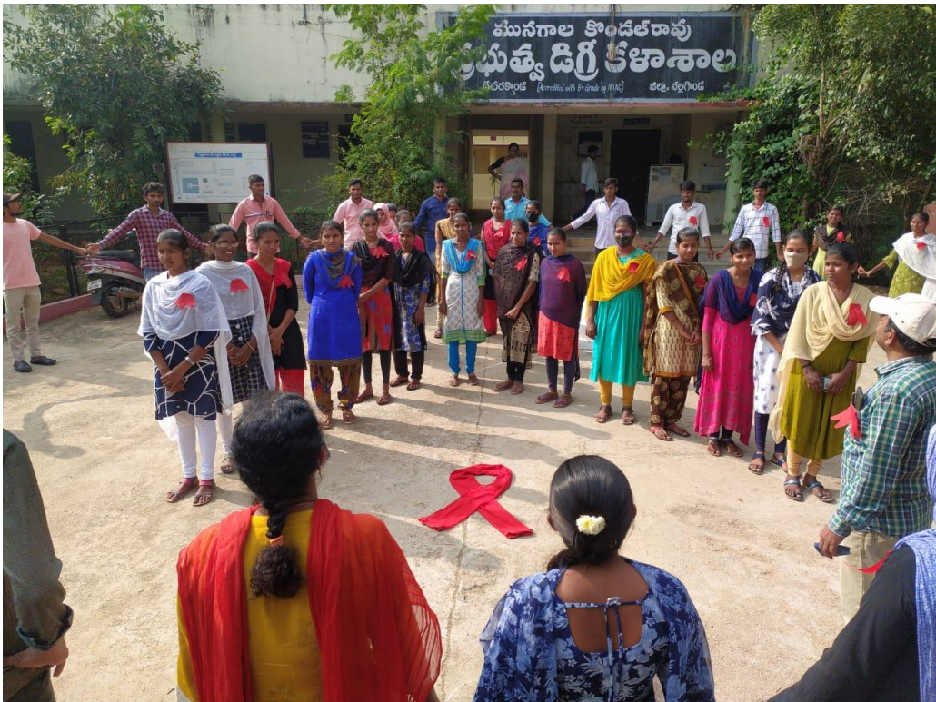
Awareness Rally on AIDS

Red Ribbon Club, MKR Government Degree College, Devarakonda conducted an awareness rally on the occasion of World Aids Day on 01.12.2018 to bring awareness among the people about causes, mode of transmission, symptoms, treatment and precautions to be taken for control the AIDS. RRC members, students and staff of the college made this programme as successful one by their active involvement