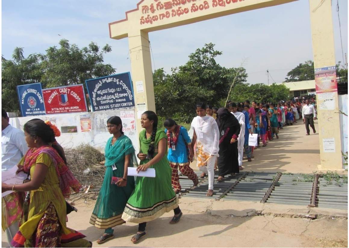
Awareness Rally on AIDS