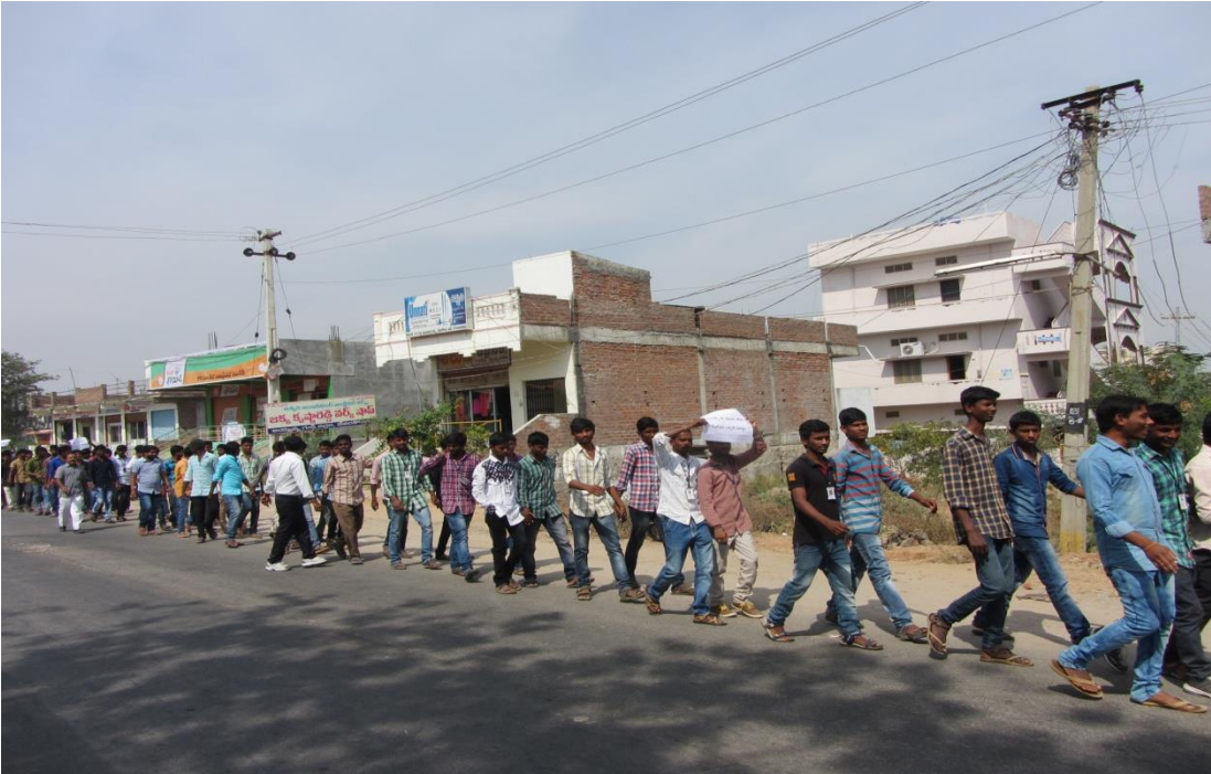
Awareness rally on AIDS