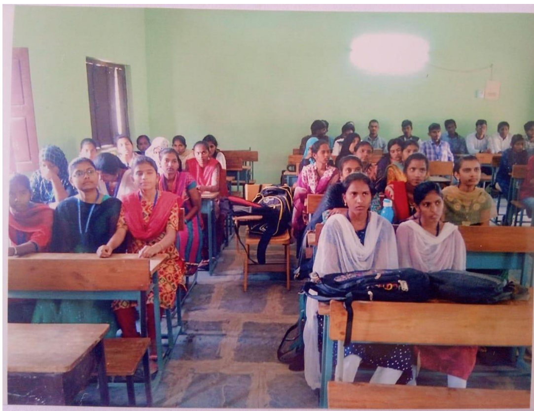
Awareness programme on AIDS

Red Ribbon Club, Departments of life sciences and NSS units of MKR Government Degree College, Devarakonda conducted awareness and blood Donation camp in the college premises in collaboration with Red Cross society. The technicians collected blood samples from college students, tested blood group and Haemoglobin percentage. They brought awareness among the students about the significance of Haemoglobin in the physiological activities, they suggested food material that enrich and enhance the percentage of haemoglobin in the blood. College staff and students made this programme as a successful one with their active involvement