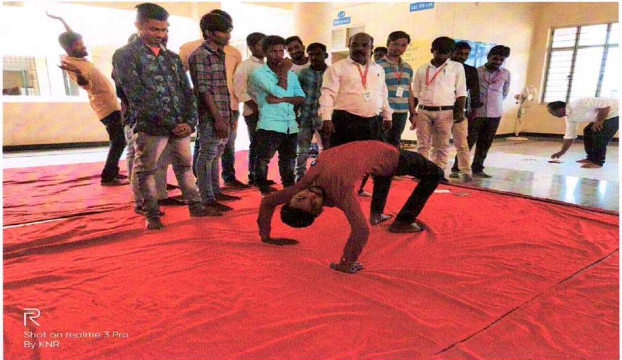
R Shot on realme 3 Pro By KNR