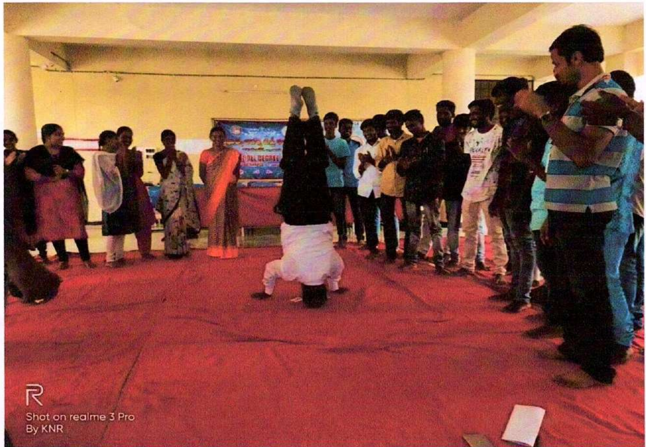
R

R. M. K. K... ... Govt Degree College NARAYANKHED Sangareddy, Dist: 502 186